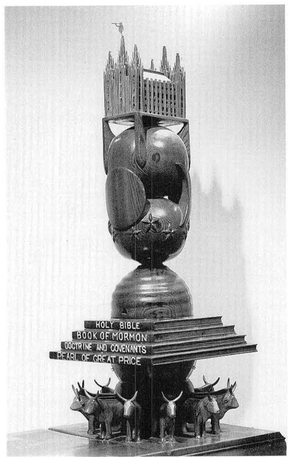
The Book of Life, by Alfred Raymond Wright (1949, carved pine, 40" high). Among the symbols included in this wood carving are twelve oxen, representing the Twelve Tribes of Israel, with a temple baptismal font resting on their backs; the four standard works of LDS scripture; a beehive, symbol of industry; spheres representing the telestial (stars), terrestrial (moon) and celestial (sun) kingdoms of glory; and a replica of the Salt Lake Temple, representing the attainment of the highest degree in the celestial kingdom. Church Museum of History and Art.

with death, burial, and rebirth), the sacrament of the Lord's Supper (with its connection to the blood and body of Christ), and marriage (which signifies both human and divine unity).