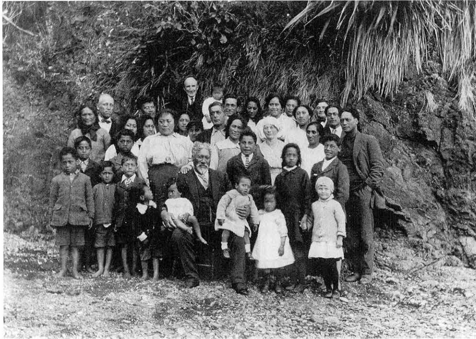
This Maori “rangatira” (chief) and family were members of the Church in New Zealand (c. 1917).

B.C. (cf. Alma 63:5–8). In a statement to the Maoris of New Zealand, for instance, President Joseph F. SMITH said, “I would like to say to you brethren and sisters . . . you are some of Hagoth’s people, and there is NO PERHAPS about it!” (Cole and Jensen, p. 388.) In the prayer offered at the dedication of the Hawaii Temple, President Heber J. GRANT referred to the “descendants of Lehi” in Hawaii ( IE 23 [Feb. 1920]:283).