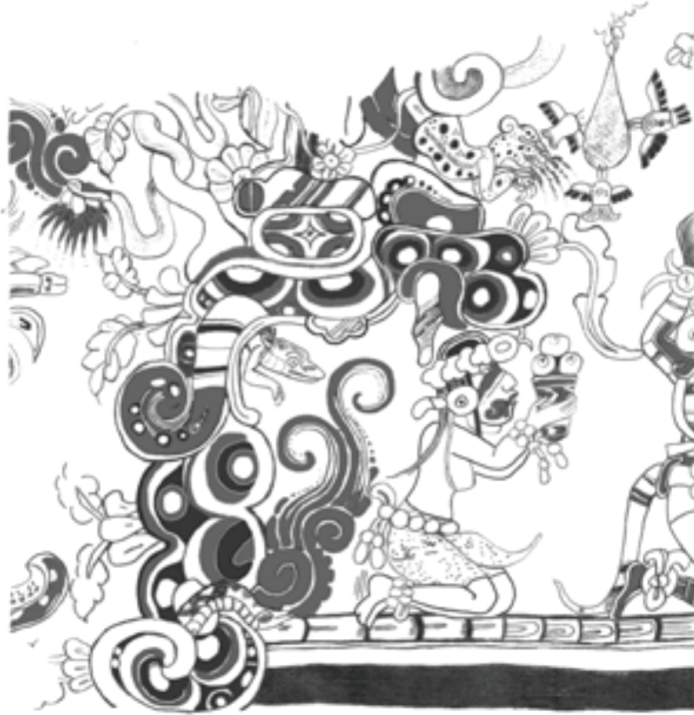
Figure 1: Flower Mountain, the paradise of creation, from the murals of San Bartolo, Guatemala (ca. 100 BC). (Drawing by Traci Wright after Heather Hurst from The Murals of San Bartolo, El Petén, Guatemala Part 1: The North Wall , 2005:8)