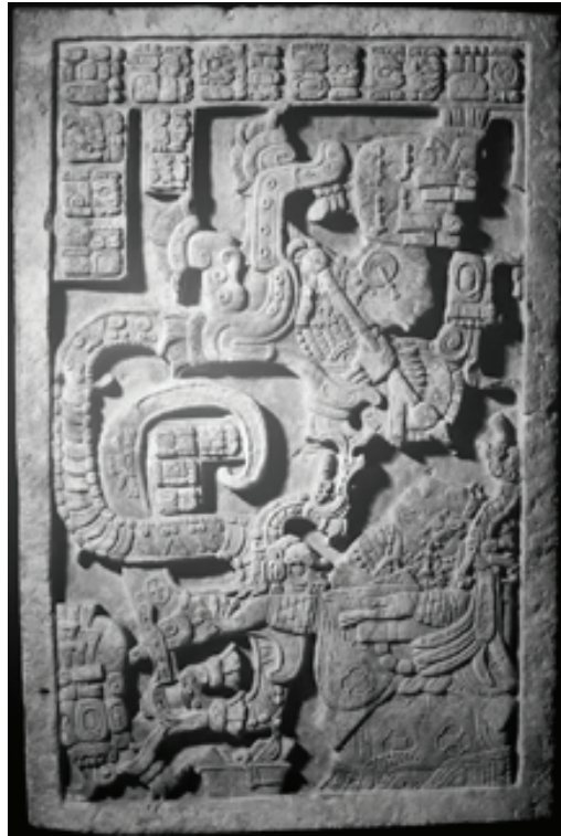
Figure 4. A Maya noblewoman conjures a supernatural being through a sacrificial burnt offering of her own blood. Lintel 25 from Yaxchilán.

effectually created a screen or portal through which supernatural beings could manifest themselves. On Lintel 25 from Yaxchilán, for example, a noblewoman named Ix K'abal Xook burns strips of paper that are soaked with her own blood. 26 From the smoke of the sacrificial bowl issues forth a vision serpent, out of whose jaws emerges a patron deity of her city.