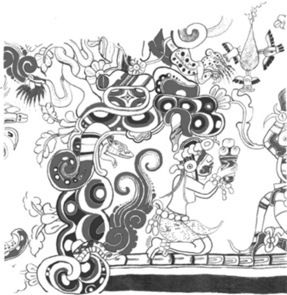
Figure 1: Flower Mountain, the paradise of creation, from the murals of San Bartolo, Guatemala (ca. 100 BC). (Drawing by Traci Wright after Heather Hurst from The Murals of San Bartolo, El Petén, Guatemala