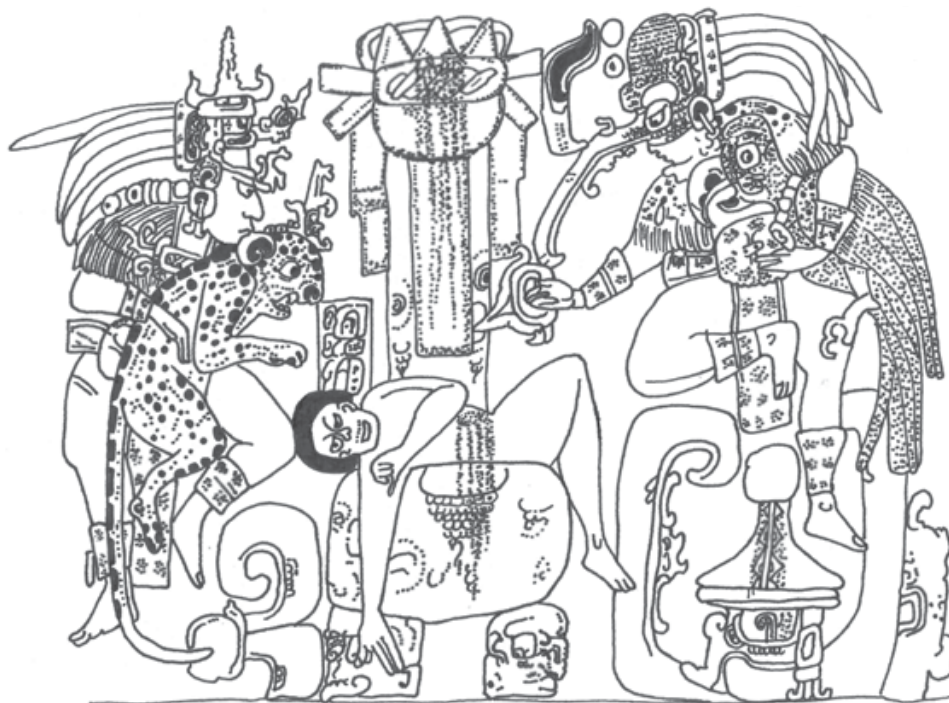
Figure 3: Classic Maya scene of sacrifice involving human, beast, and fowl. (Drawn by Traci Wright after Alexandre Tokovinine from Reading Maya Art: A Hieroglyphic Guide to Ancient Maya Painting and Sculpture , 2011:92)

It stands to reason that the Zoramites, in rejecting Nephite religion, would embrace the cultural practices of the more dominant culture, as would be expected of an apostate group. 22