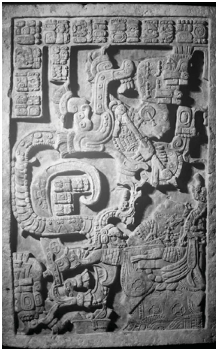
Figure 4. A Maya noblewoman conjures a supernatural being through a sacrificial burnt offering of her own blood. Lintel 25 from Yaxchilán.

the sacrificial bowl issues forth a vision serpent, out of whose jaws emerges a patron deity of her city.