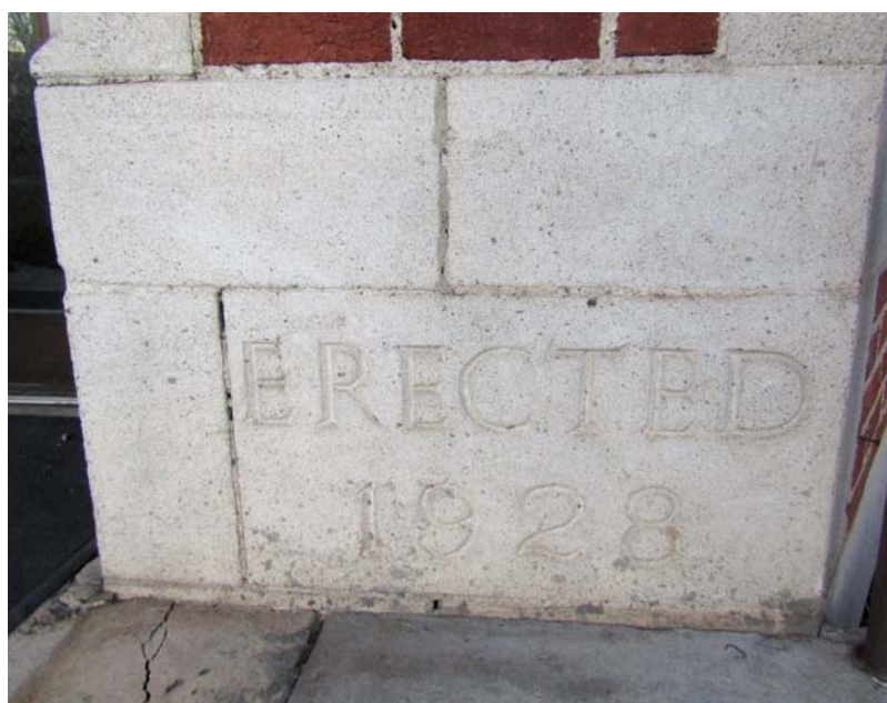
Cornerstone of a Latter-day Saint Church building in Provo, Utah.

Ephesians 2:20 “built upon the foundation of the apostles and prophets, Jesus Christ himself being the chief corner stone” Christ’s church was initiated by Himself. Christianity was not started by Paul or any other apostle as is commonly debated by biblical scholars. 26 Those in the New Testament called prophets were not the same as we hold them today. In the early church, a prophet was one who testified of Jesus Christ (Revelation 19:10), while the apostles held the keys (Matthew 16:19; see also Ephesians 4:11). The Quorum of the Twelve Apostles held the keys and directed the work, not as “one” prophet. Many people were referred to as prophets who spoke with the Spirit for God (Acts 21:9). Nevertheless, without the superstructure of