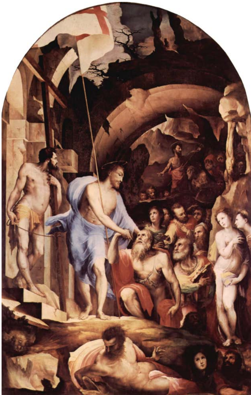
The Descent of Christ into Limbo by Domenico di Pace Beccafumi, ca. 1535.

like the way the NIV explains that Jesus gave the organization as gifts, “Christ himself gave the apostles.” Some of the names of the leaders differ—a pastor is a shepherd, but we use the name “Bishop.” Even though the Greek word for “evangelist” meant, “a missionary, bearer of good tidings,” Joseph Smith defined it differently: “An evangelist is patriarch...wherever the church of Christ is established in the earth, there should be a Patriarch for the benefit of the posterity of the Saints, as it was with Jacob in the giving of patriarchal blessings unto his sons.” 30