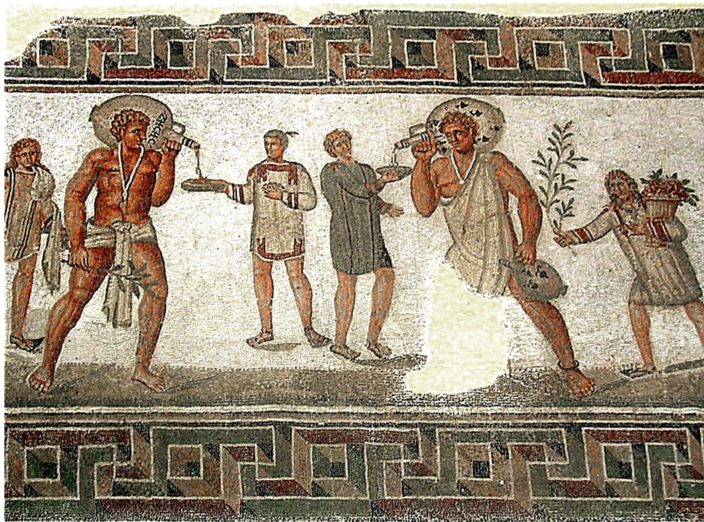
Mosaic depicting Roman slaves.

Epistle: Gentiles may become joint-heirs. Peter's revelation in Acts 10:9–48, came from the Spirit and opened the door for this specific mystery. The Lord taught Peter (and was later verified by the Quorum of the Twelve and the whole church), that the Gentiles had been cleansed through Christ's atonement, and were no longer unclean. They could be adopted into the covenant, too. There were converts to Judaism before that time, but not without complying with the Law of Moses. Peter's vision taught that Jesus' grace, was completely extended to the Gentiles. Now the chosen people are those who choose to follow Jesus' way.