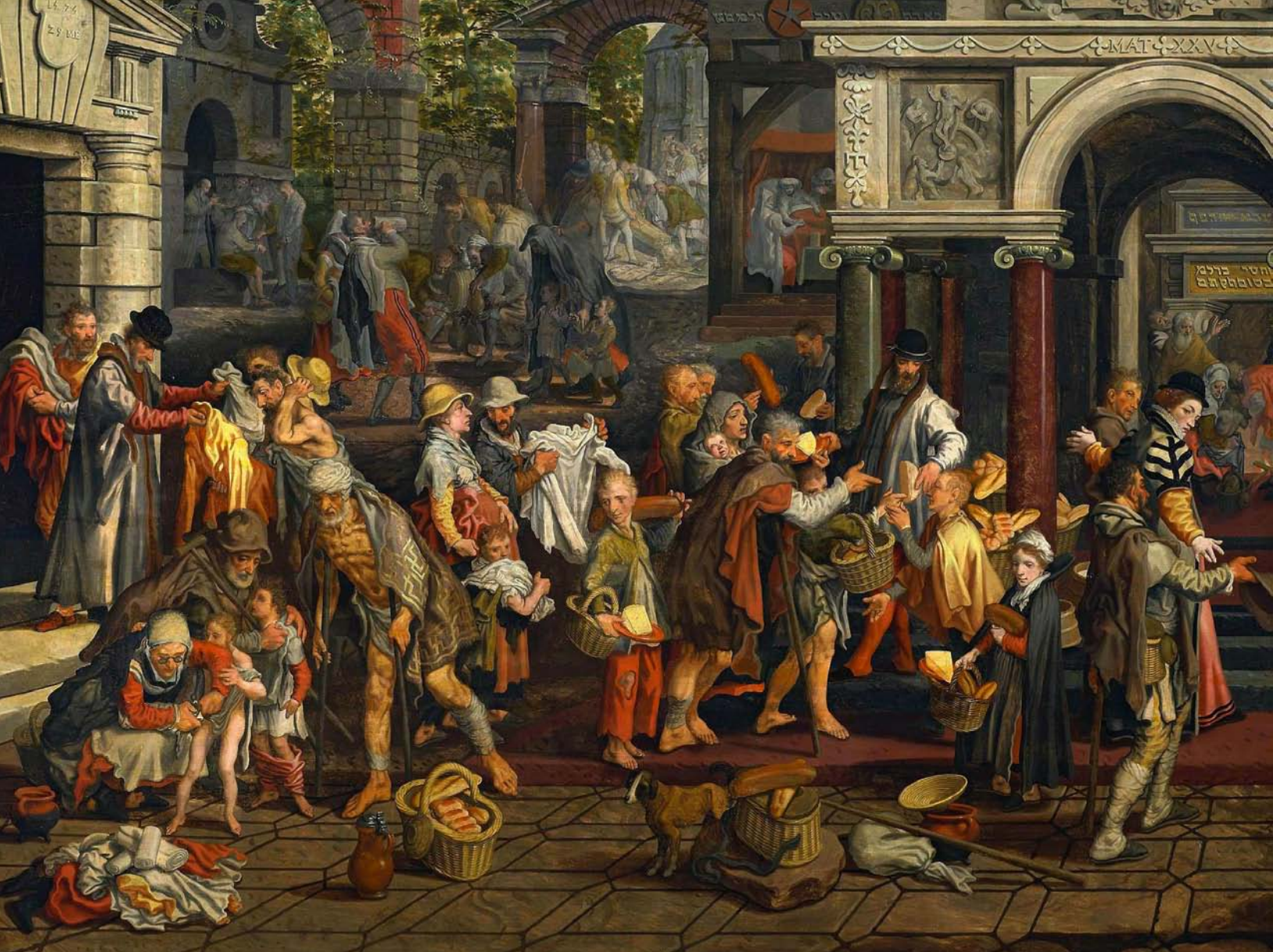
The Deeds of Christian Charity by Pieter Aertsen, 1575.

2 Corinthians 9:8–10 “God is able to bless you abundantly, so that in all things at all times, having all that you need, you will abound in every good work” (NIV) We can trust that God will provide for his servants’ needs. As further evidence, Paul cites Psalm 112:9.