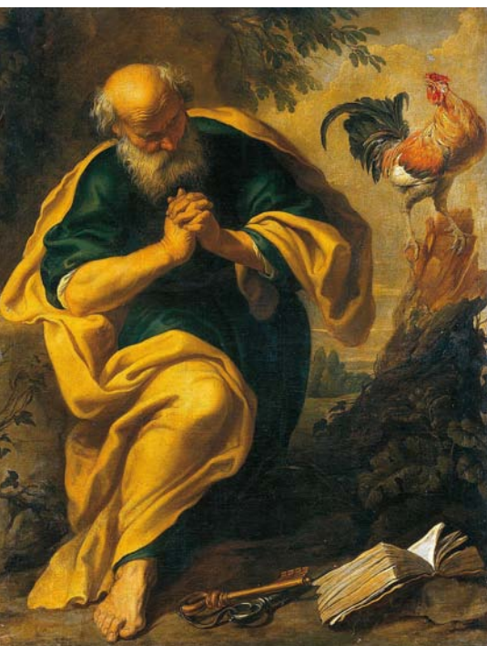
Repentance of St. Peter by Gerard Seghers, ca. 1629.

2 Corinthians 7:10 “Godly sorrow brings repentance that leads to salvation and leaves no regret” (NIV) Christ’s teachings of repentance are not to produce guilt, but teach us how to convert that regret or shame through repentance into hope in Christ and joy in God’s plan of redemption. Russel M. Nelson, spoke on the repentance as a process that we all need. He asked,