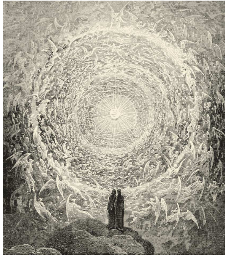
Rosa Celeste: The Highest Heaven of Dante's Divine Comedy by Gustave Dore.

2 Corinthians 12:7 “in order to keep me from becoming conceited, I was given a thorn in my flesh” (NIV) Paul felt that in order for the Lord to keep him humble, He gave him a “thorn in the flesh” or “splinter.” We do not know what Paul's thorn was, but he says it was Satan's way of buffeting him. Some suggest a physical ailment, others emotional or spiritual.