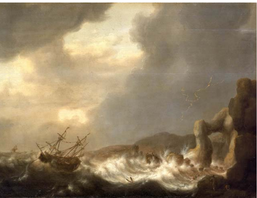
Ships Wrecked on a Rocky Shore by Hendrick Staets.

2 Corinthians 11:24 “Of the Jews five times received I forty stripes save one” Paul enumerates the abuse he had recently endured while serving as a witness of the Christ. He mentions being whipped five times. In Deuteronomy 25:1–3, Moses set a limit on how many whippings a guilty man could receive: “no more than forty lashes.” Jewish rabbis reduced that number to 39, just in case there was a miscount. They flogged or whipped an offender thirteen times on the chest, thirteen times on the right shoulder and the same on the left shoulder. During a Jewish scourging, it was common for someone to read Deuteronomy 28:58, 59; 24:9 and Psalms 78:38–39. 12 As a Roman citizen, could Paul could have refused to undergo this whipping? He was protected from Roman torture without being proven guilty, but in the Jewish setting, had he refused, he may have been excommunicated and not been allowed into the synagogue where he often taught.