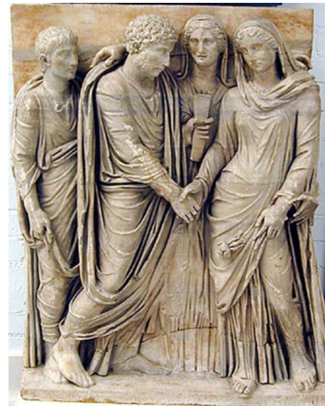
Fragment from the front of a sarcophagus; relief showing a Roman marriage ceremony.

2 Corinthians 11:3 “Just as Eve was deceived by the serpent’s cunning, your minds may somehow be led astray from your sincere and pure devotion to Christ” (NIV) Paul does not want his young converts to be deceived as Eve was by the cunning of Satan or his pawns.