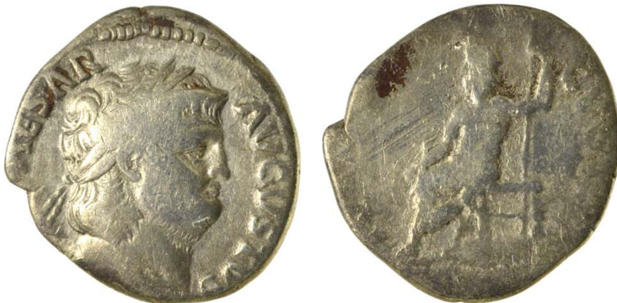
Roman denarius of Nero, ca. A.D. 63–68.

words, “Now/dē” (BSB), or “Moreover” (KJV). Their “grace /charis” or “a gift” (RSV) came from their altruism. It reflected God’s divine grace that they received. Once he has expressed his appreciation of the Corinthians’ repentance and improved relations between them, he returns to the old matter of business, the collection of offerings for the poor and Jerusalem church. He deliberately refers to their neighboring churches in Macedonia (Philippi, Thessalonica, and Berea) where he was then serving.