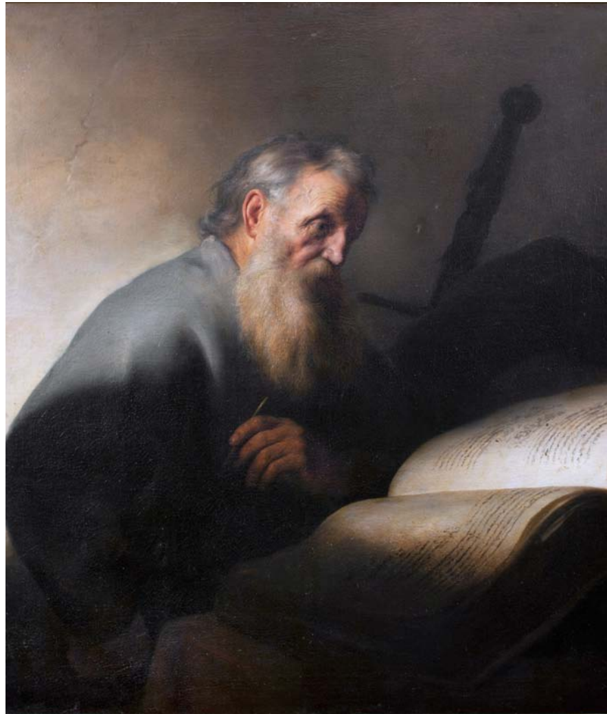
St. Paul by Jan Lievens, ca. 1629.

2 Corinthians 12:12 “Truly the signs of an apostle were wrought among you in all patience, in signs, and wonders, and mighty deeds” Paul appeals to the Corinthians’ own experience of his apostolic authority. They saw him perform “signs and wonders” through the gifts of the Spirit as a true disciple. The account in Acts 18:1–18, touched on Paul’s eighteen months in Corinth including his powerful testimony, a vision, faith, hope, leadership, and endurance. Paul’s Epistles speak of his love or charity for the saints there.