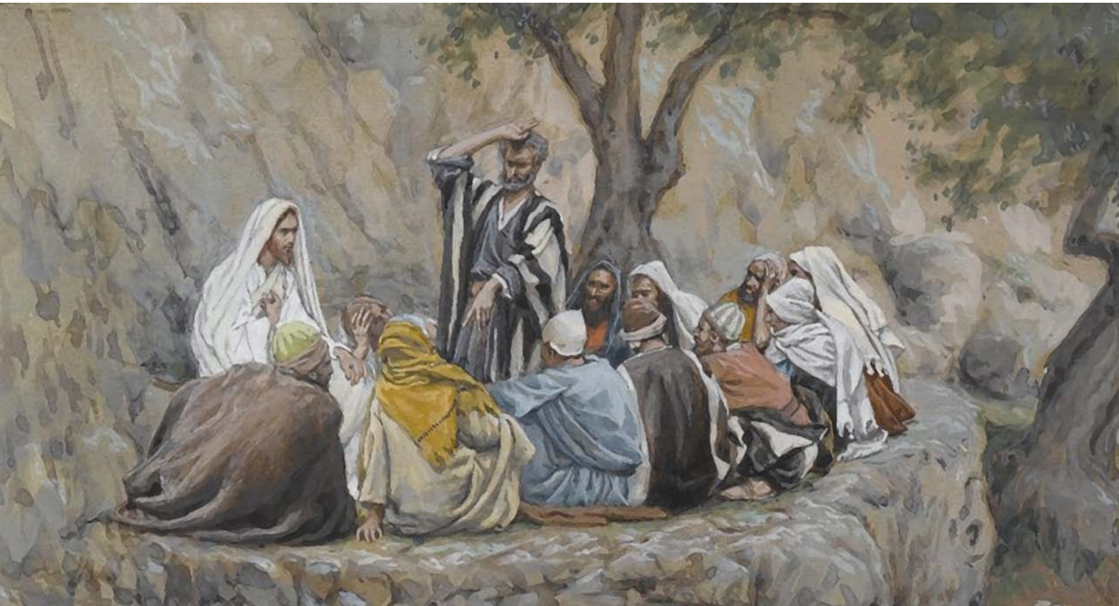
The Primacy of Saint Peter by James Tissot.

Matthew 16:11–12 “then they understood” The Gospels of Matthew and Mark share the text until these verses when Matthew deviated from Mark’s record to include Jesus’ explanation of the leaven. 12 Jesus warned them not to follow the false “teachings” (RSV, NIV, ASV, etc.) or “doctrine” (KJV) of the Pharisees or any other puffed-up and corruptible intellect or leader. One of the major objections that Jesus has against the Pharisees is that they were so caught up in the details of their traditions (Oral Laws) that they could not appreciate the higher law or even the original Law of Moses.