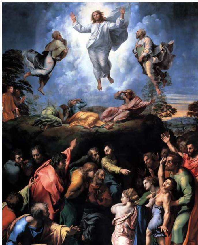
Transfiguration by Raphael, ca. 1518-1520.

Matthew 17:1-9; Mark 9:2-10, Luke 9:28-36