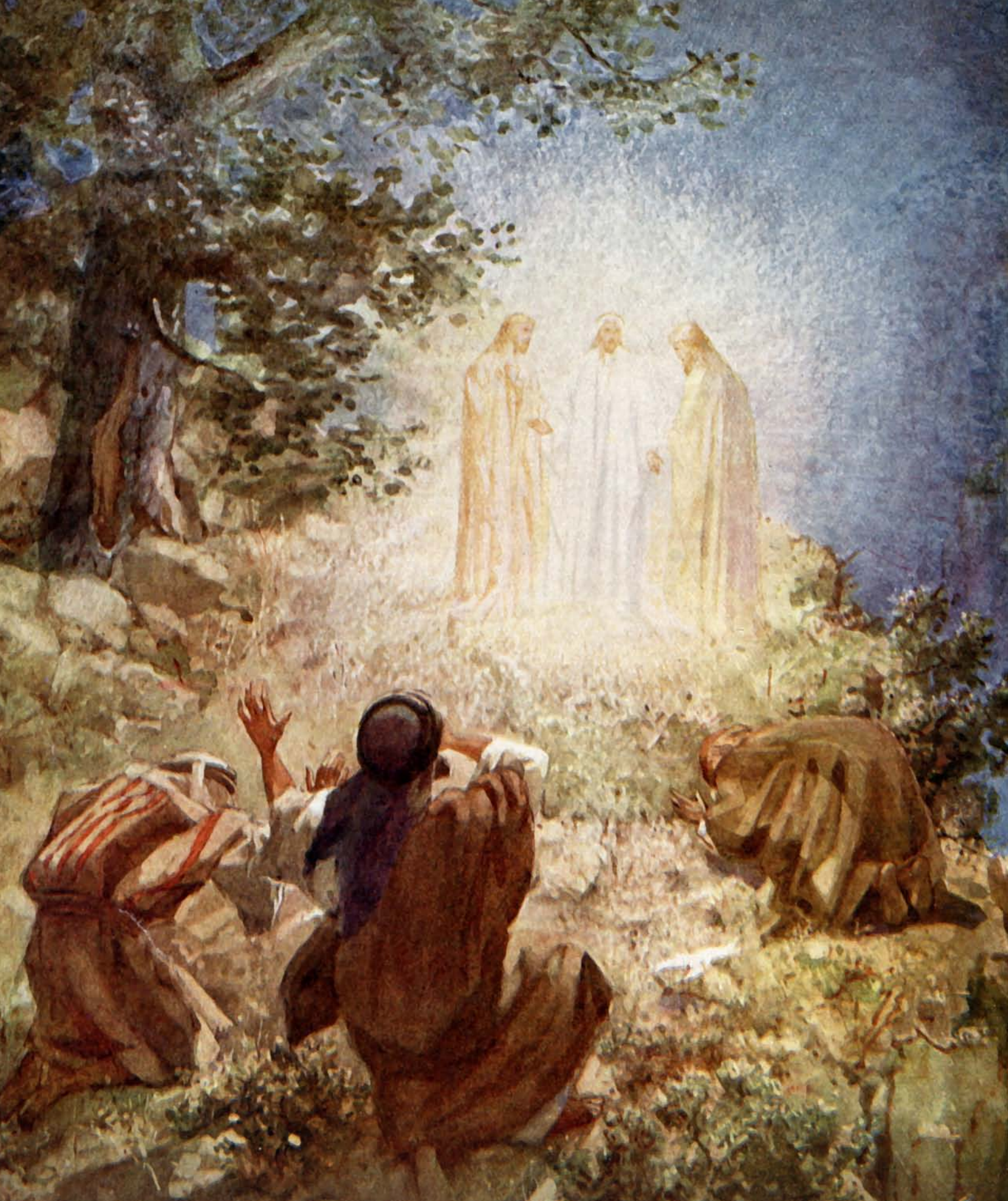
Jesus is Transfigured before Three Disciples by William Hole, 1905.