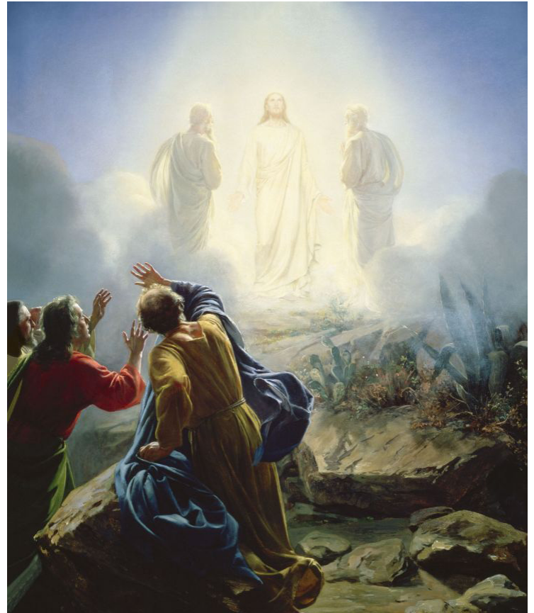
Transfiguration of Jesus by Carl Bloch, 1872.

Luke 9:31–32 “ were heavy with sleep ” Luke alone adds two verses about the apostles being asleep for part of the vision, and then awakening to see the glorified beings. Luke also suggests that Moses and Elias talked to Jesus about his upcoming death “and resurrection” (JST) in Jerusalem. I ask myself how could they have fallen asleep at such a time. Yes, they were fatigued from their climb up the mountain, but more likely, I presume God had them sleep so as to not hear those parts of the vision (For other examples of the Lord using a deep sleep see Genesis 20:21; and Mosiah 24:19).