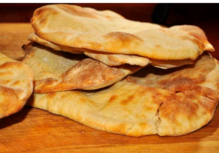
Photo of pita bread

“beware of the leaven of the Pharisees” The disciples traveled in a boat to a secluded place. 8 It appears that they were again in an area without a place to buy food—or at least sanctioned or “clean” food. The law of Moses outlined which foods were “clean” for human use. By the time of the NT, hundreds of oral laws were added to that list (including not being able to eat food prepared or grown on gentile lands).