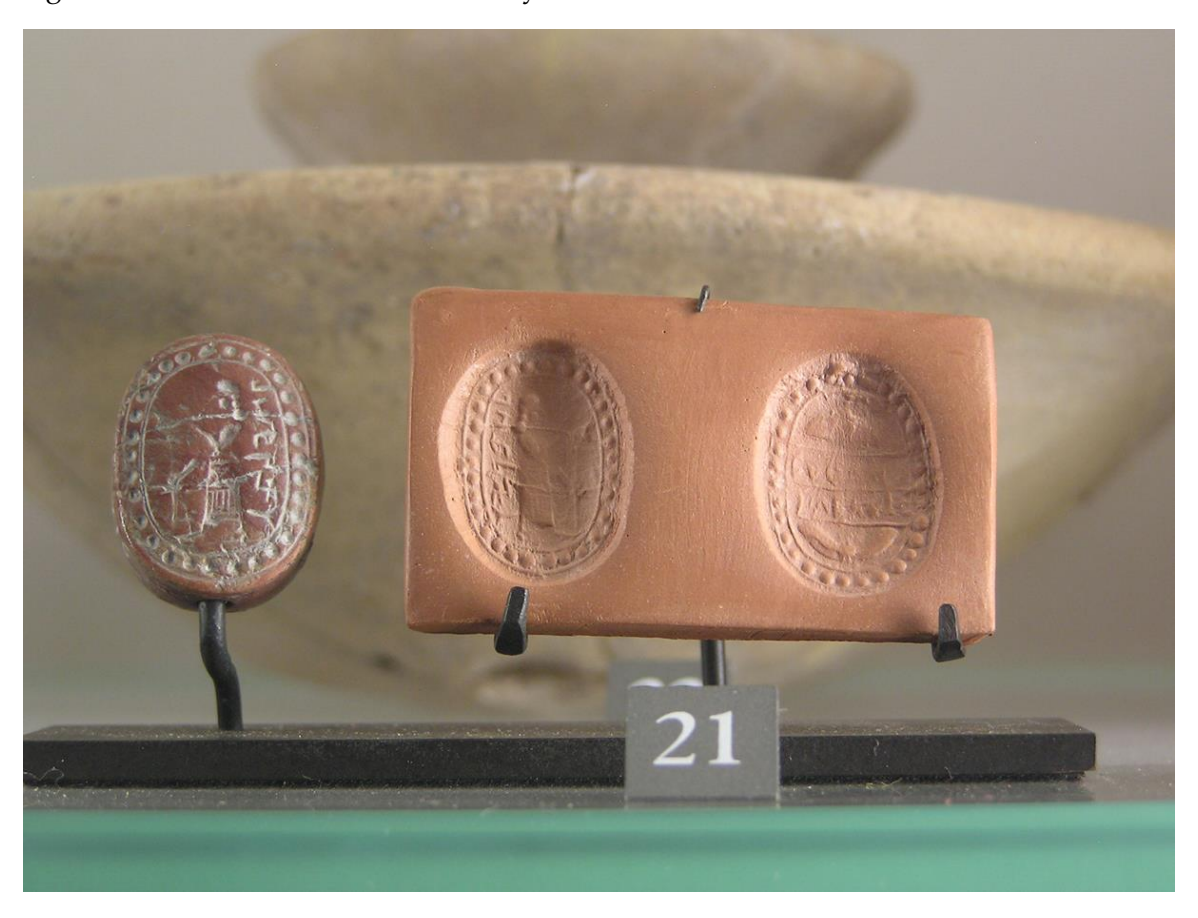
Figure 1 Pre-exilic Hebrew royal seal, in the Louvre Museum, Paris.

When the Book of Revelation chapter 5 talks about John seeing a book that was written on the inside and on the outside, sealed with seven seals, and given to the judge who can then break the seal, he may well have been using this standard kind of authentication of documents. A similar mode of authenticating a real estate deed is found in Jeremiah 32. This authentication method is evident in Hebrew, in Greek, and in Latin. It was used in Mesopotamia for over 2000 years before the time of Christ. There are numerous ancient legal documents authenticated this way.