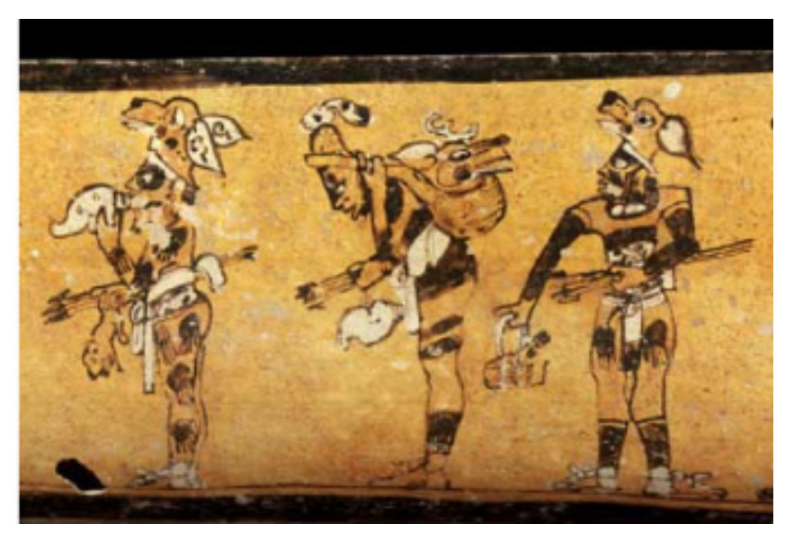
Figure 7. Detail of camouflaged Maya hunters, courtesy of Justin Kerr, K1373, Dumbarton Oaks, Trustees for Harvard University, Washington, DC.

Bishop de Landa observed that black and red were the primary colors of the ancient Maya body paint palette. This corroborates the Book of Mormon's lexicon of colors associated with conflict.<sup>109</sup> Indeed, these are the only colors that Nephite prophets mentioned, except for white and one reference to gray hair. They employed color with "great restraint."<sup>110</sup> Among the Maya, the first "quantum leap" in color complexity did not come until after about 300 BCE.<sup>111</sup>