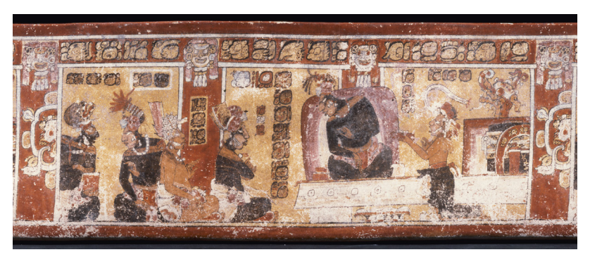
Figure 5. Enthroned Maya Lord and attendants courtesy of Justin Kerr, K2784, Dumbarton Oaks, Trustees for Harvard University, Washington, DC.

Hunting involved more variety, as shown in the following roll-out view of a deer hunting scene on a Maya vase. The hunters' designs, however, all had one obvious purpose. Each of them used black paint as a "form of camouflage for ... stealth" so that "the human body could thereby not be easily distinguished from the mottled light and color under the jungle canopy." Black handprints, a primitive art form, were "set upon" hunters as well as warriors to conceal them in the shadows and forest greenery. It seems logical that Lamanites, as well as Nephites (see Enos 1:3, 20), would have relied on similar disguise when hunting, as do hunters today. By the way, it was no coincidence that the markings evident in figures 6 and 7 mimicked the jaguar, the largest of the world's spotted cats and the most feared predator in Mesoamerica. 106