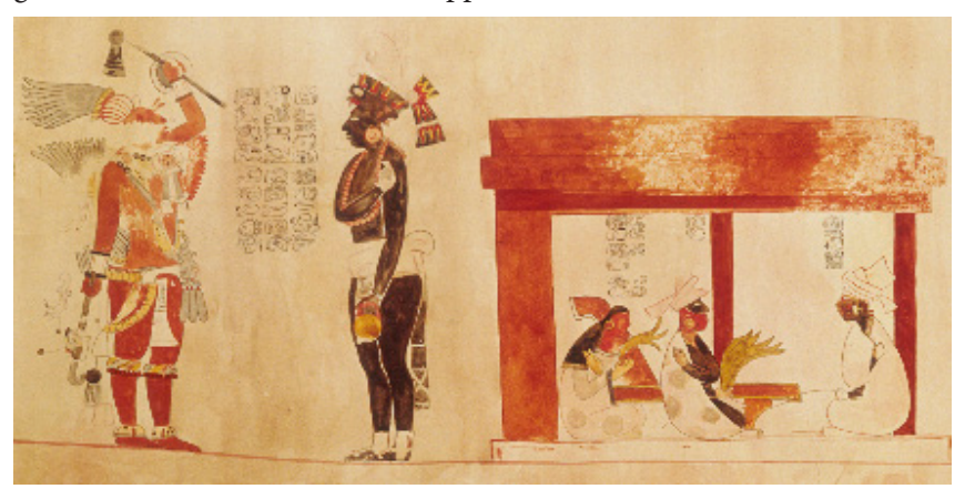
Figure 1. Detail of Uaxactun mural (circa 300 BCE–900 CE). Museum Collections, 1950. Courtesy of the Peabody Museum of Archaeology and Ethnology, Harvard University, 50–1–20/22982.

Fascinating details about this tradition are revealed in a mural at Uaxactun in northern Guatemala (inhabited between 300 BCE and 900 CE).94 According to Mayanists Coe and Houston, Figure 1 depicts a Maya personage who is painted in black (except for his hands and feet) and is greeting a visitor who is costumed as a Teotihuacan warrior. Both are wearing loincloths. According to these scholars, the three "noble ladies" seated nearby are displaying their body paint. 95 They suggest that face painting on females may have been seen as "alluring." Initially Nephi perceived that the skin of blackness, which may have been soot and charcoal at that time, would prevent his people from being enticed by Lamanites, who were "exceedingly fair and delightsome" (2 Nephi 5:21).97 However, the flattering cosmetic decor upon the women in this mural illustrates how later, an artistic application of stains may have enhanced their natural beauty. Figure 2 shows additional detail from the same mural. It depicts two men wearing elaborate ceremonial garments about their loins. The upper torso of one is blackened.