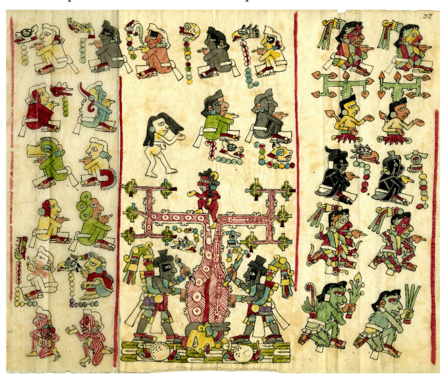
Figure 8. The Tree of Apoala, Vindobonensis Codex (post 900 CE). © The Trustees of the British Museum. Used with permission.

that mimics the Maya. They are surrounded by men engaged in various activities, painted in diverse colors and patterns.