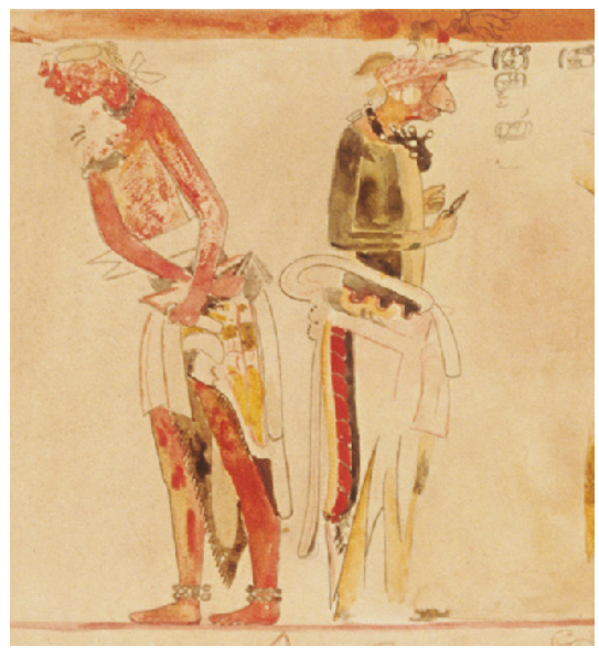
Figure 2. Detail of men in Uaxactun mural. Peabody Museum of Archaeology and Ethnology, Harvard University.