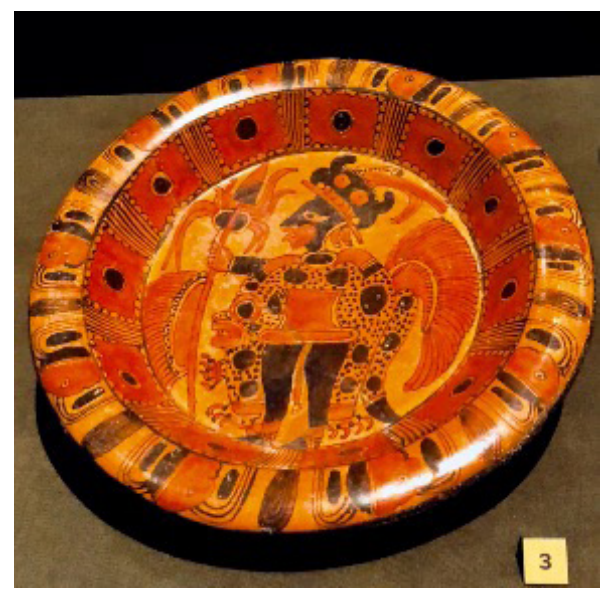
Figure 3. Maya ceramic plate (circa 593–731 CE). Courtesy of the Denver Museum of Nature & Science, AC.8652.

Blackening is depicted on numerous cylindrical vases in Justin Kerr's impressive collection of photographs of Maya artifacts. ^{100} Mayanists associate the scene in Figure 4 with the ruler Sak Muwaan who reigned