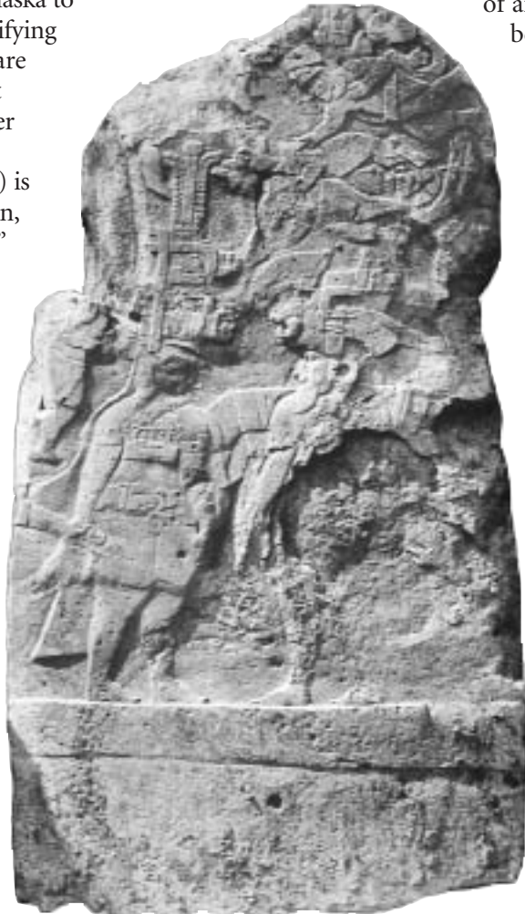
This scene from La Venta Stela 3 (southern Veracruz state, ca. 600 B.C.) shows, on the right, a man with a large, beaked nose and a sizable beard. Such figures have been termed “Semitic” and “Uncle Sam” by some art historians.

The number of Native American languages spoken at the time European conquerors or settlers arrived is not known for sure, but a current best estimate is around 1,000 from Alaska to Argentina. 62 Methods of classifying those into larger groupings are varied and inconsistent, but hemisphere-wide the number of major groupings (whether called “families,” “stocks,” etc.) is on the order of 80. In addition, there were about 80 “isolates,” that is, single tongues that have not been convincingly connected to any other language or grouping. 63 Mesoamerican languages fit into perhaps 14 families, with upwards of 200 separate tongues having once existed in the area. (A family is a group of tongues believed to have descended from a common ancestral language.) Indications are strong that there was considerable linguistic differentiation in Mesoamerica as early as 1500 B.C. 64 Latter-day Saint students of the Book of Mormon should understand that long prior to Lehi’s day, Mesoamerica was already linguistically complex. 65 Moreover, many archaeological sites were occupied continuously, or so it appears, for thousands of years without clear evidence in the material remains of any replacement of the culture of the inhabitants. That continuity suggests, although it does not prove, that many of those people probably did not change their tongues.