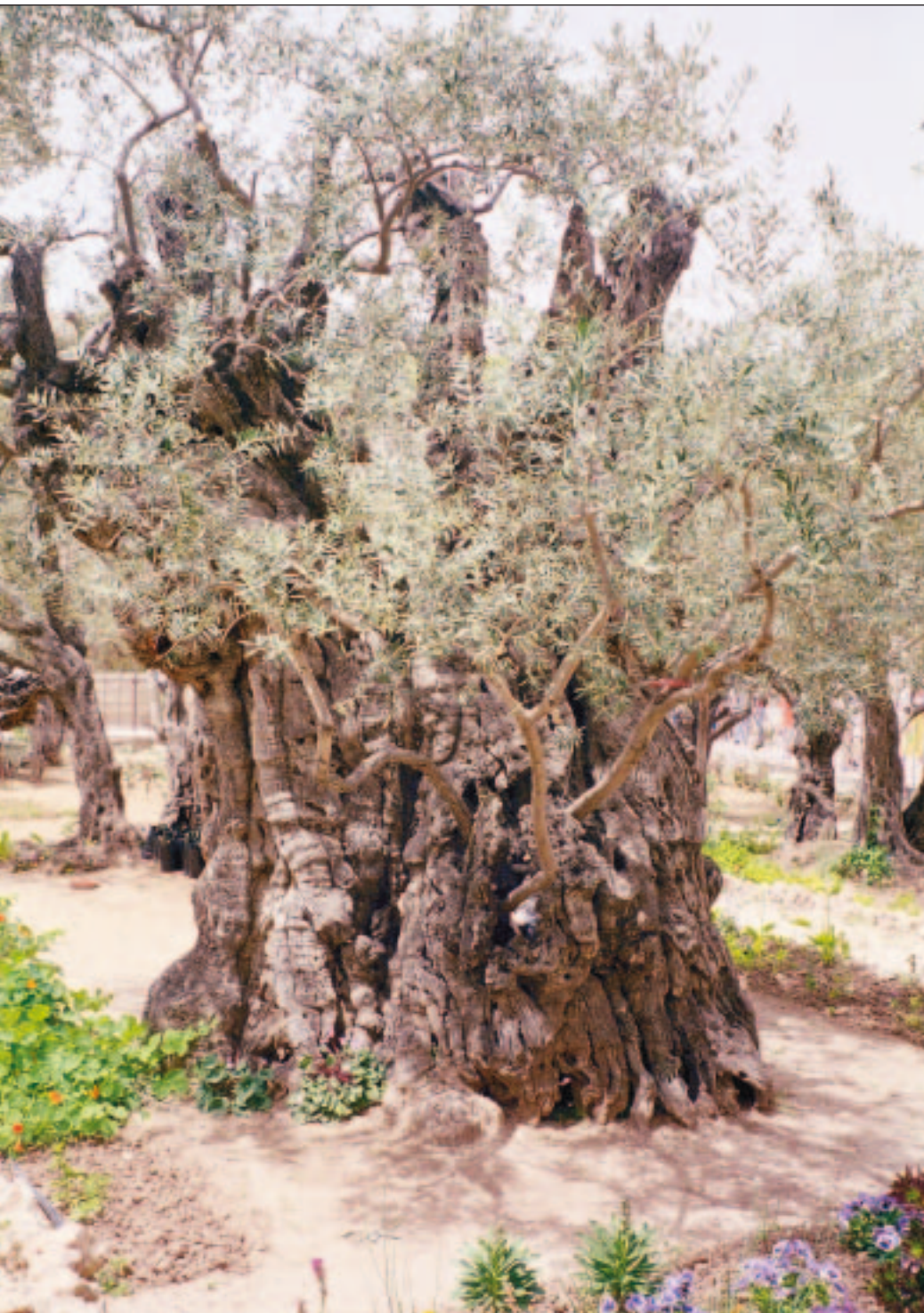
In the Book of Mormon's figurative language of the olive tree, we are taught that a "branch" from the original ethnic tree representing Israel in Palestine would be carried to the American promised land, where it would be "grafted" onto an indigenous root or people.