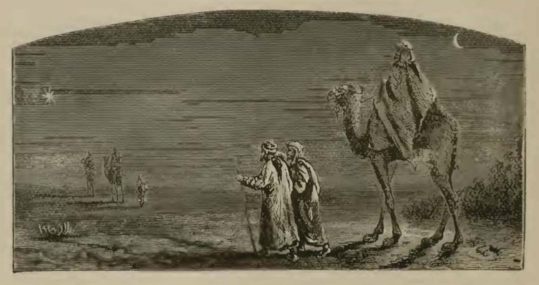
THE NEW STAR.

new star had also appeared in the heavens. Then the faithful rejoiced, their hearts were full to overflowing, they knew that their Redeemer was born, and that the great plan of salvation had entered its most glorious phase; God, the great Jehovah, was tabernacled in the flesh. But the wicked quaked with awful dread, they realized the extent of their iniquity, they sensed that they were murderers at heart, for they had plotted to take the lives of the righteous, and in the terror that