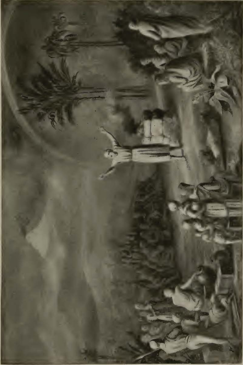
THE FIRST SACRIFICE ON THE PROMISED LAND.