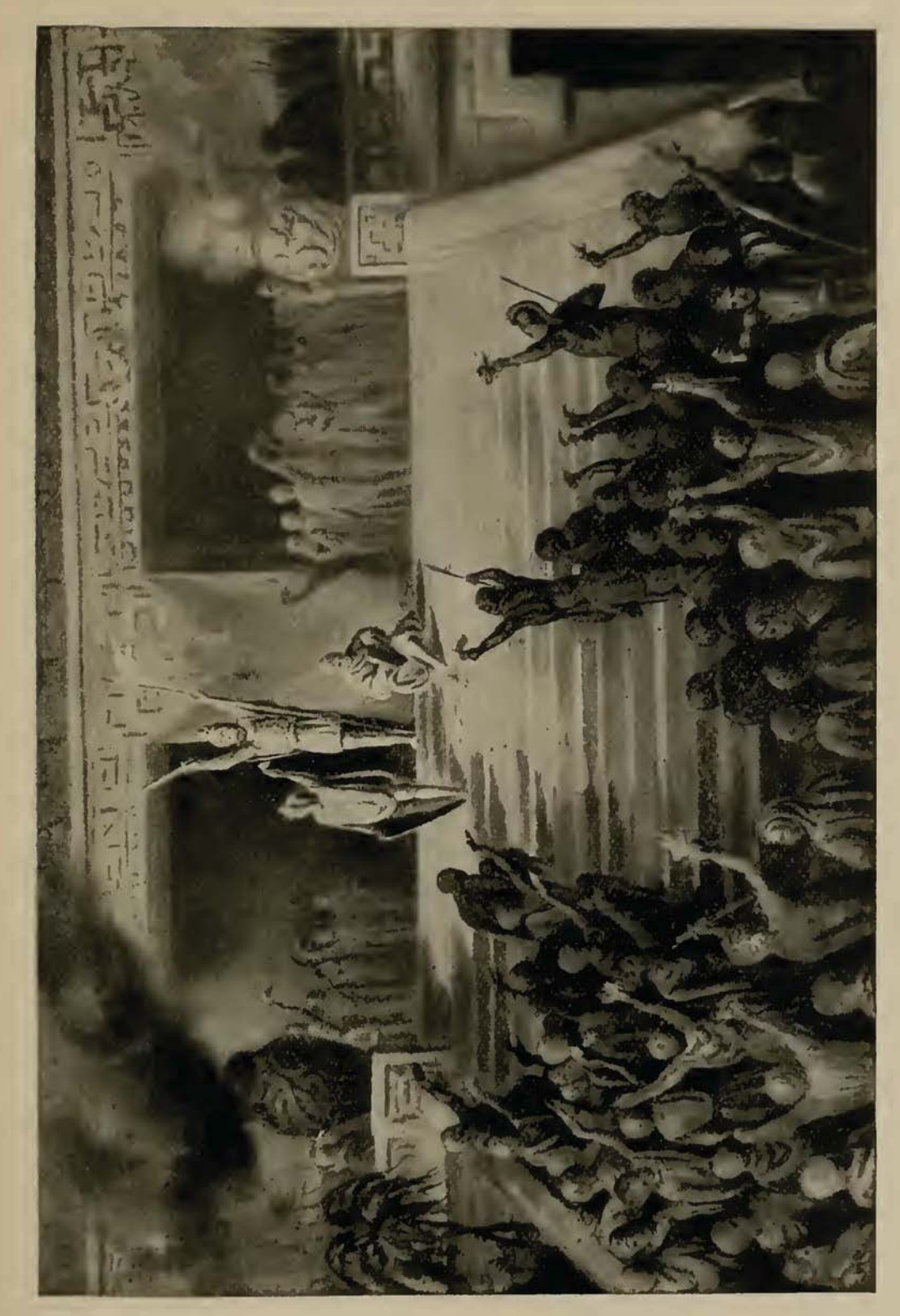
MORONI RAISES THE "TITLE OF LIBERTY,"