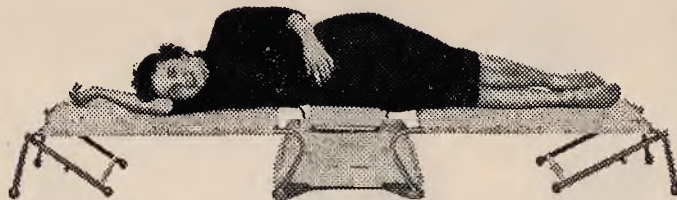
STAUFFER'S "MAGIC COUCH"® in the beautiful new Princess Model