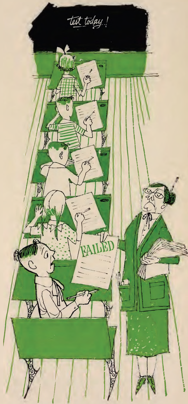
Failed to pass a test which was never given because of failure to pass it.