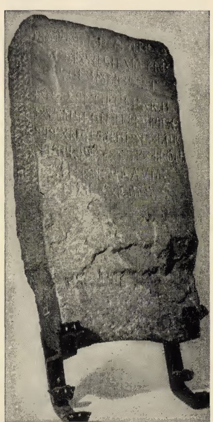
The Kensington Runestone

ORONI assures us that it is the Lord who is running things, and that men miss the whole point and meaning of their lives by failing to recognize the fact: "... the winds have gone forth out of my mouth, and also the rains," (Ether 2:24) he tells the brother of Jared-but to men it does not seem that way, for the Lord is constantly showing forth "great power, which looks small to the understanding of men." ( Ibid. , 3:5.) Men simply do not have faith and so deny themselves the blessings and the powers that might be theirsboundless knowledge, "knowledge of all things" that is "hid up because of unbelief." (Ibid., 4:13.) Given faith, God will not withhold from us a knowledge of all things. And ironically enough, men know that they should have faith even apart from the thought of any reward, "for it persuadeth [men] to do good." (II Nephi 33:4.) You begin with hoping-"man must hope, or he cannot receive an inheritance," (Ether 12:32) for "faith is things which are hoped for and not seen; wherefore, dispute not because ye see not, for