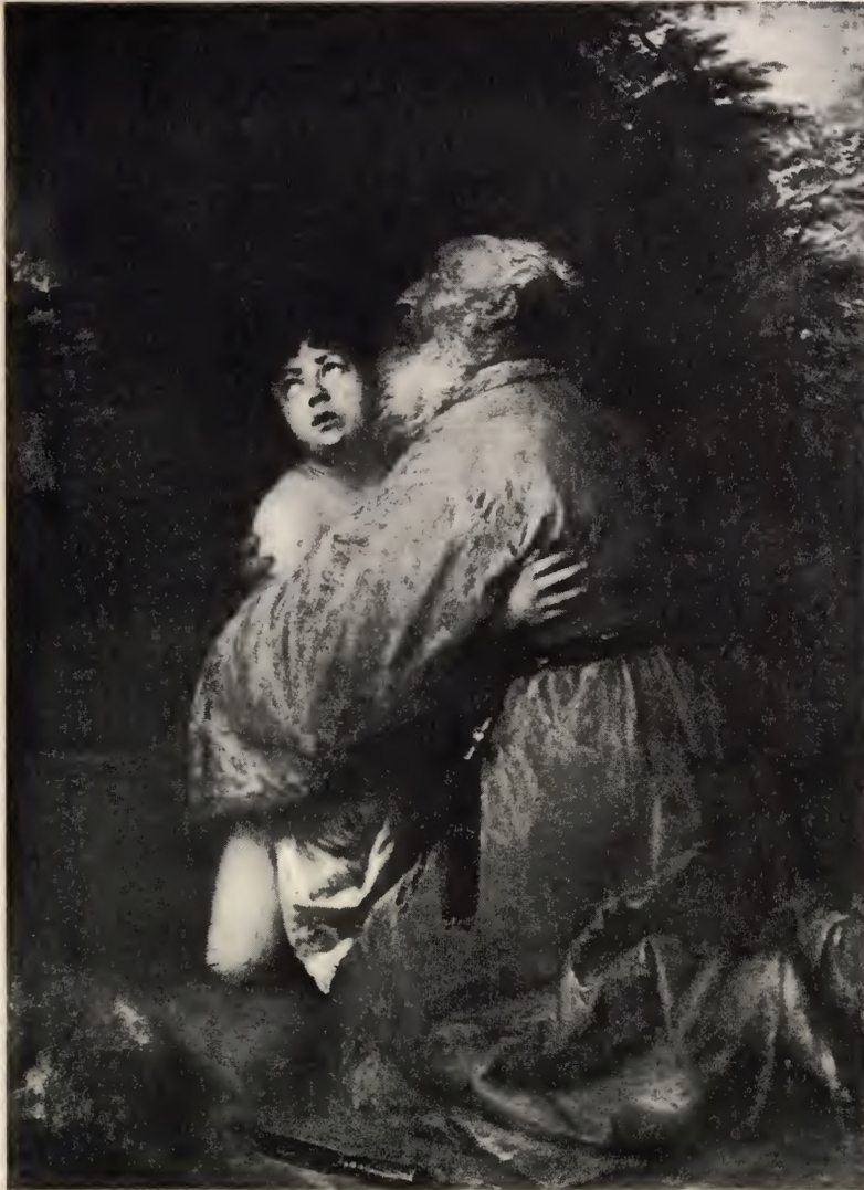
"Abraham's Offering," a painting by Jan I. Levens

A New Look at the Pearl of Great Price Part 8 (Continued)