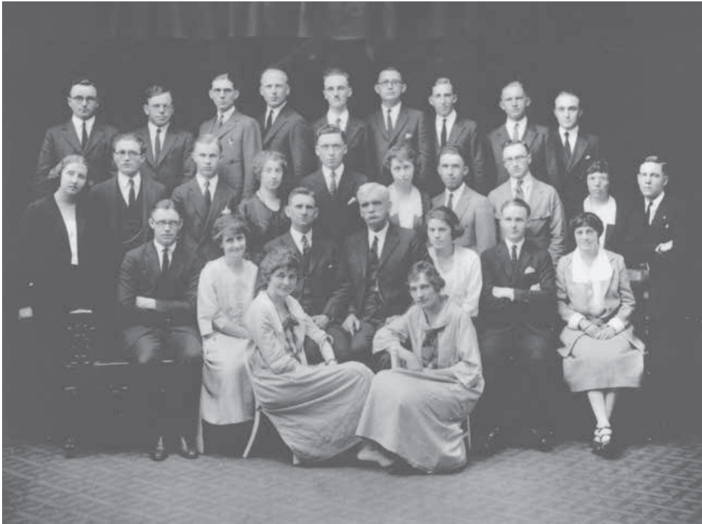
President B. H. Roberts with Eastern States missionaries, Brooklyn, New York, June 1922.

largely considered antiquated; most mission presidents understood the seriousness of “labor, passport, and mendicancy laws” in effect countrywide and did not ask their missionaries to risk breaking them. 36 Although Roberts was considered “old school” in certain respects, he still adjusted the country work to conform with twentieth-century missionary norms. 37 His instructions were clear: The elders and sisters were not to “go rushing through the country on straight lines in the direction started upon,” nor would there be any “ambition to make a record of miles traveled.” He encouraged them instead to prayerfully go “trusting in the Lord,” sharing their message with any person willing to listen