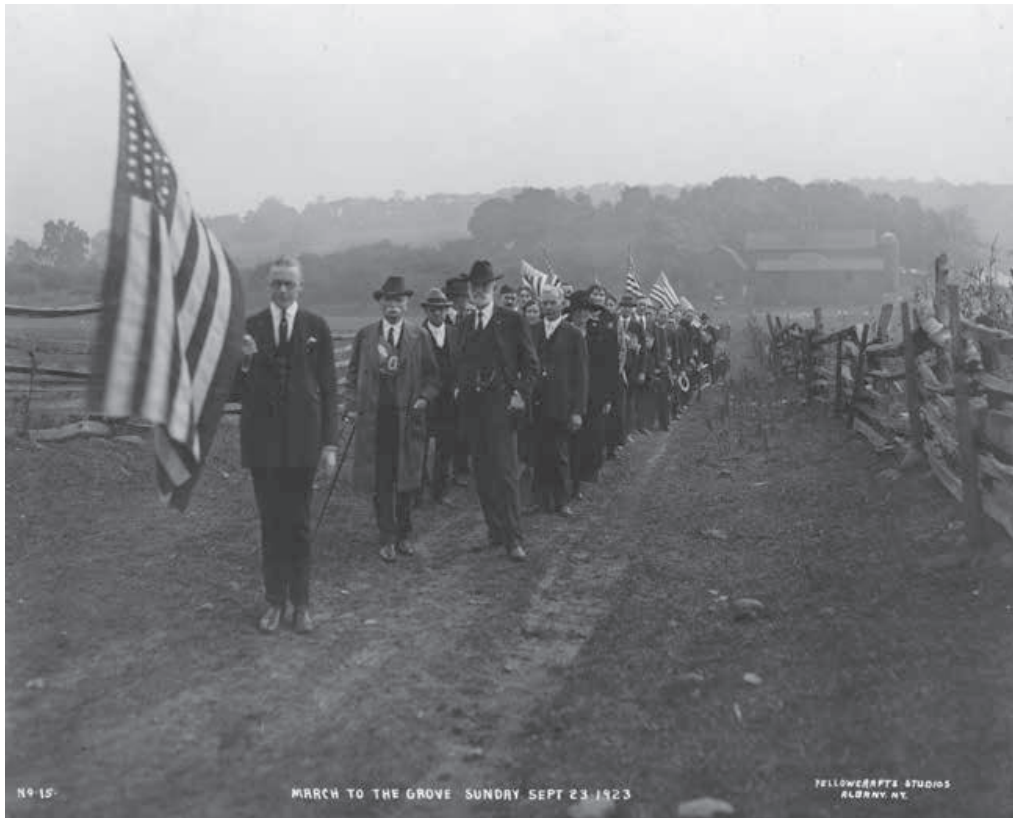
Church leaders and missionaries march to the Sacred Grove, Palmyra, New York, September 23, 1923.