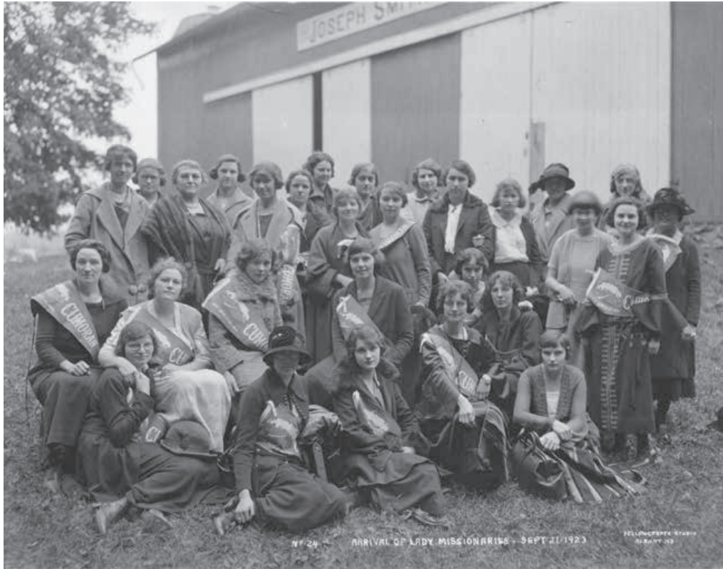
Arrival of lady missionaries at the Smith Farm, Palmyra, New York, September 21, 1923.