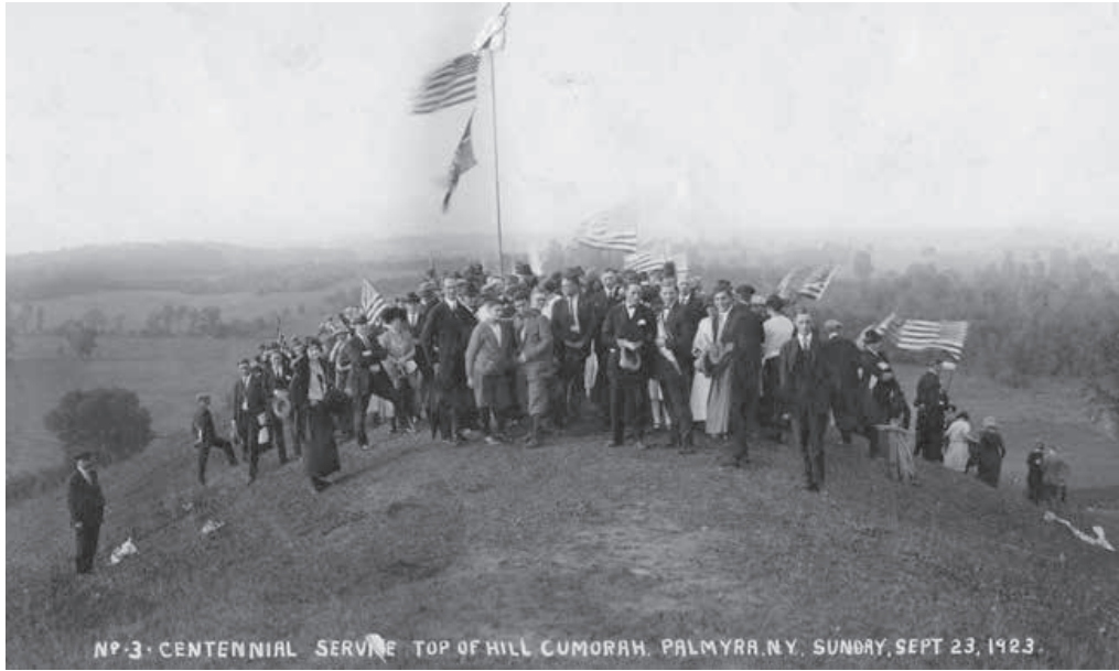
Centennial service on top of Hill Cumorah, Manchester, New York, September 23, 1923.