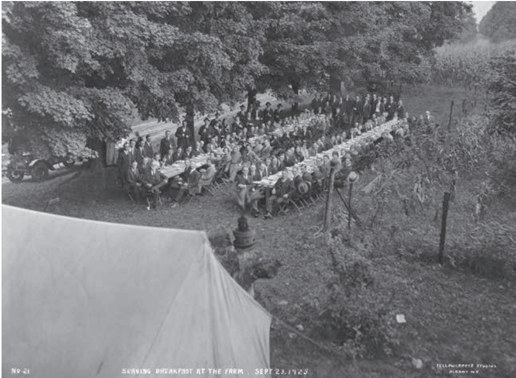
“Serving Breakfast at the Farm” to Eastern States missionaries and Church members, Smith farm, Palmyra, New York, September 23, 1923.

afternoon, followed by an opening dinner held on the evening of Friday, September 21. 75 Later, missionaries and members poured into the large tent for the first of the weekend’s meetings—a commemoration of the angel Moroni’s first visit to Joseph Smith one hundred years earlier. Two hymns were sung celebrating the angelic visitation, and the group was formally welcomed to the special conference. Before the meeting closed, the missionaries were invited to report on their summer proselyting labors. 76 Overall, the body was made “comfortable and pleasant” by the enclosed tent shielding them from the constant dribble of rain. 77