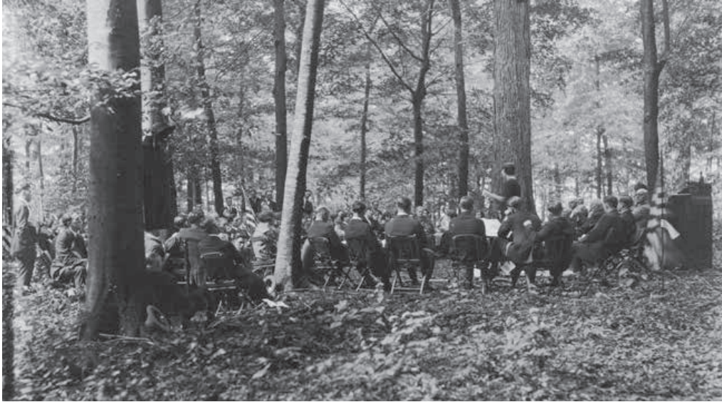
Sabbath service in the Sacred Grove, Palmyra, New York, September 23, 1923.

self-surrender, missionaries and leaders felt spiritually uplifted, renewed, and transformed in the place where the historical and contemporary churches met.