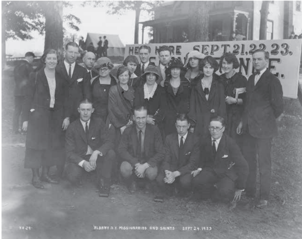
Eastern States missionaries and Saints from Albany, New York, in front of the Smith frame home, Palmyra, New York, September 24, 1923.

conference, we were happy that we were able to go home by train,” one elder recalled, “instead of having to retrace our steps by foot.” 120