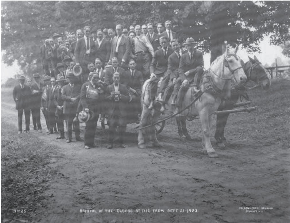
Arrival of the Eastern States Mission elders at the Smith Farm, Manchester, New York, September 21, 1923.

commemorate the centennial of an event that took place on that self-same hill one hundred years earlier in 1823.