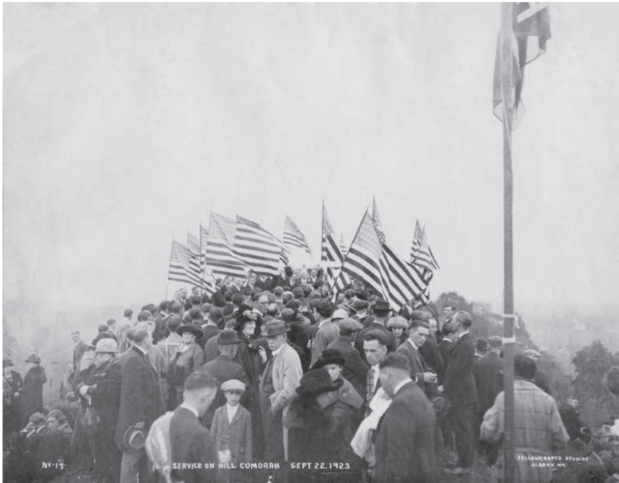
Centennial service on top of the Hill Cumorah, Manchester, New York, September 23, 1923.