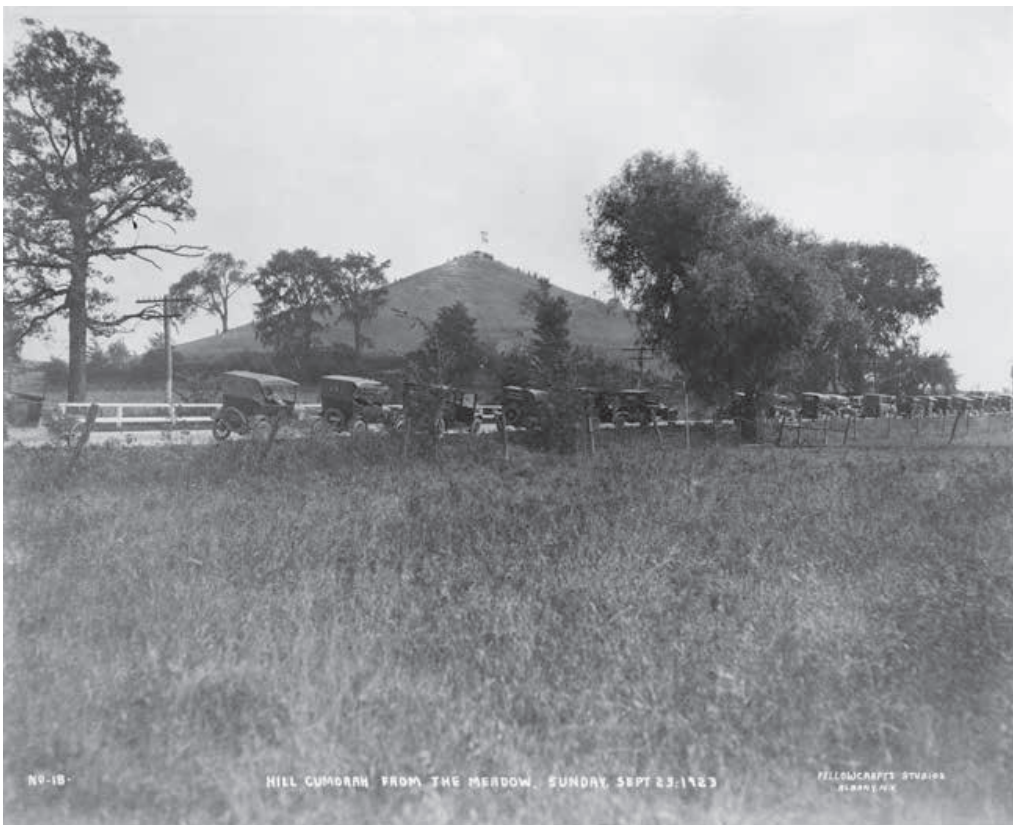
“Hill Cumorah from the Meadow” with automobiles in foreground, Manchester, New York, September 23, 1923.

Early September signaled the end of the Eastern States Mission’s summer proselyting campaign as its elders and sisters set their sights on the cradle of the Restoration. 68 All missionaries were instructed to arrive at the Joseph Smith family farm on September 21, 1923—not a day before, or a day after. Each companionship donned their personalized pennants as they traversed the highways and rail lines of the East Coast toward Upstate New York. Others walked—and kept on walking for several weeks—until they arrived. All told, over 150 elders and sisters made the journey to Palmyra. 69