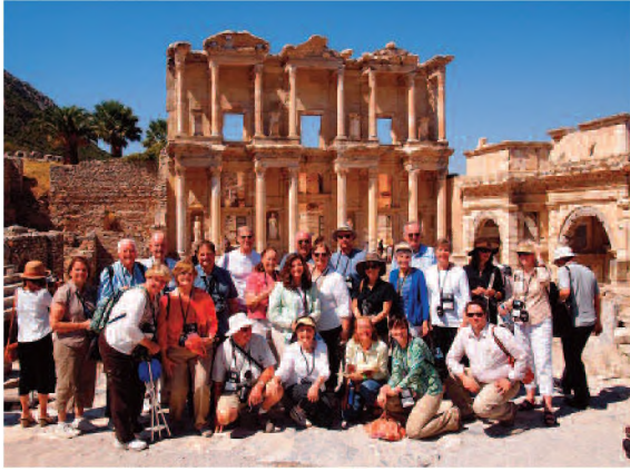
The development council in front of the Library of Celsus