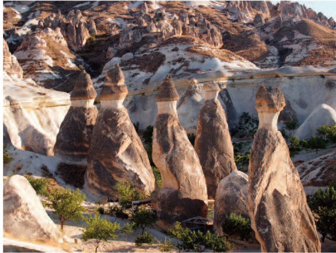
The Göreme Valley of Cappadocia, Turkey

Turkey are not just home to geographical wonders, however. There we found evidence of centuries of Christians living in the harshest of environments, with homes, churches, and monasteries hewn out of volcanic rock formations. The frescoes in these rock-hewn churches were far simpler and less elegant than