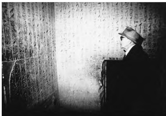
Hugh W. Nibley, PhD

Those interested in applying for the first time or who wish to renew their fellowships for the 2013-14 academic year should submit a completed application form and all supporting documentation by July 31, 2013. The Nibley Fellowship guidelines and an application form are