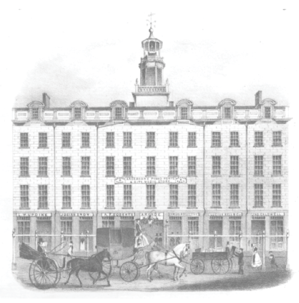
Figure 2. Reynolds Arcade, from an 1844 sheet music publication.<sup>15</sup>

With the construction of the Barge Canal in 1918, the canal was moved south of the city of Rochester. Since the Genesee River Aqueduct was no longer needed, a road deck for Broad Street was built atop the aqueduct in 1922–1924, and the aqueduct was modified internally to carry the tracks of the Rochester Subway (or Rochester Industrial and Rapid Transit Railway) from 1927 to 1956. The Broad Street Bridge deck was rebuilt as it stands today in 1973–1974.<sup>14</sup>