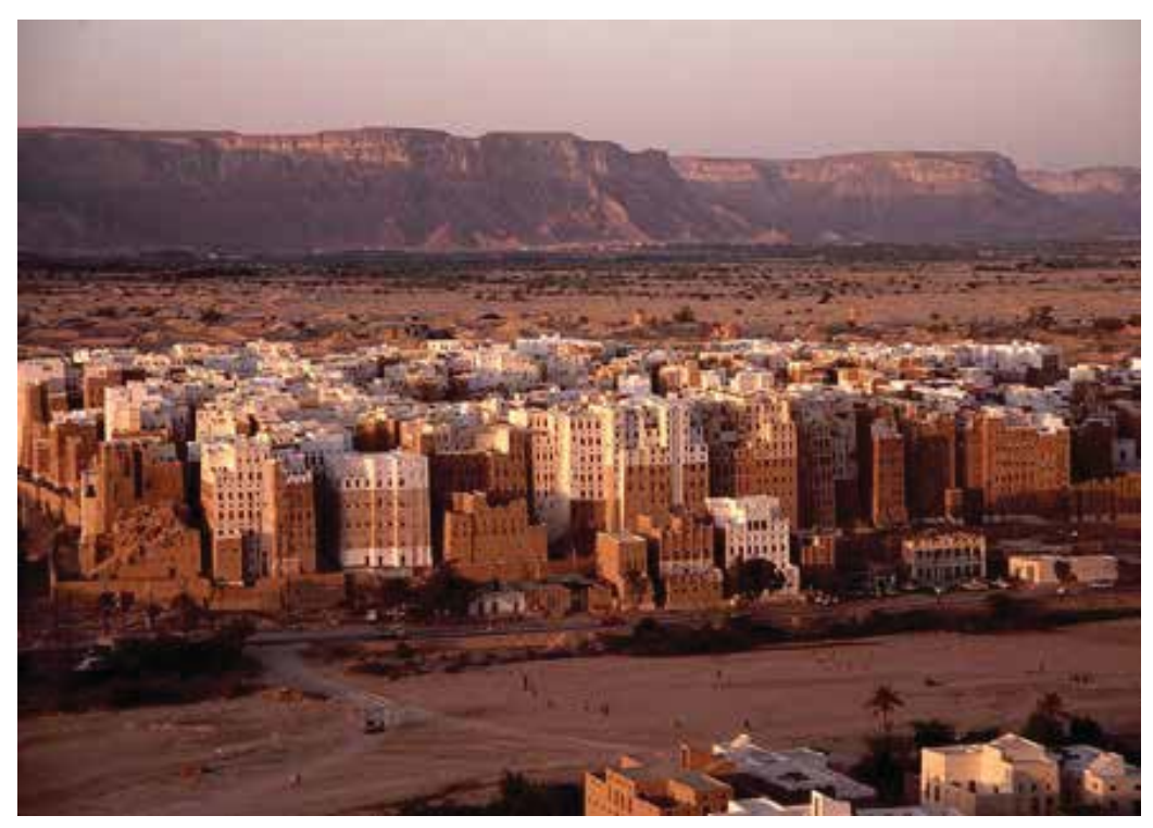
Figure 6. Modern Shibam reflects the ancient Yemeni tradition of multistory buildings.<sup>161</sup>

this aspect — for what the family would yet experience in Arabia. To be sure, the dream was highly symbolic. Yet it also corresponds in some of its prophetic dimensions to historical and geographical realities.<sup>160</sup>