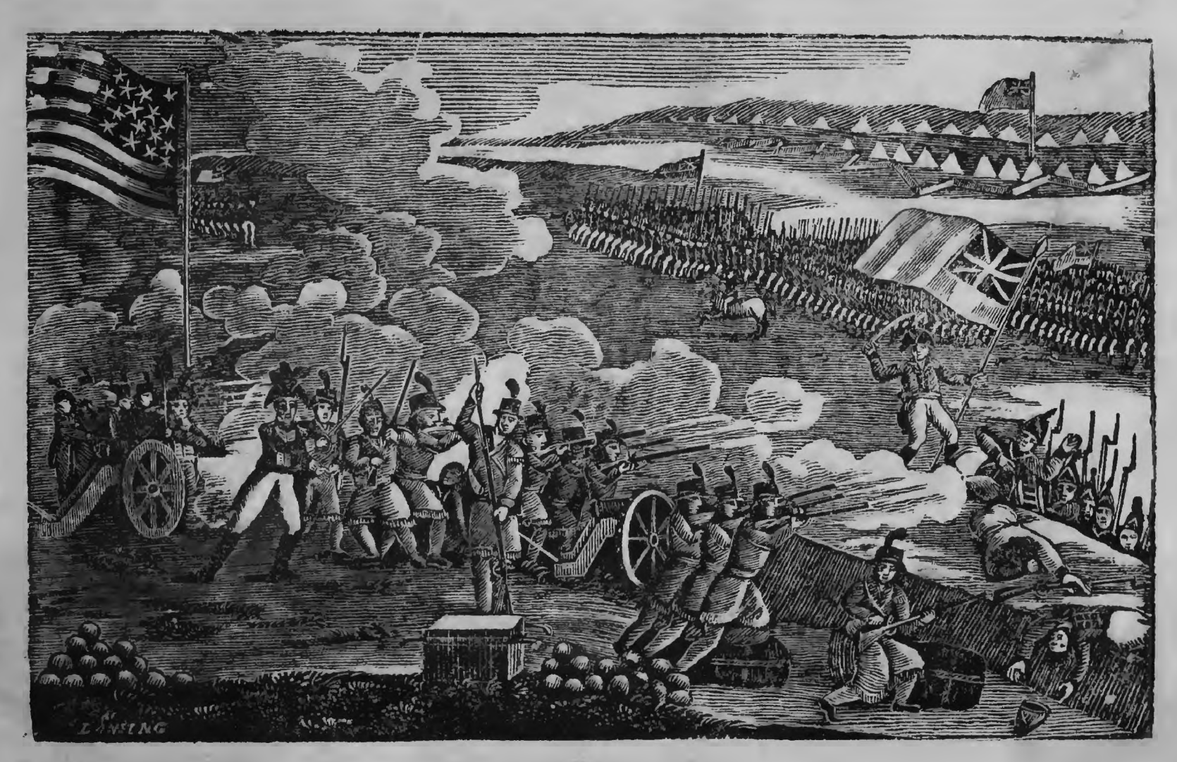
BATTLE OF NEW-ORLEANS,