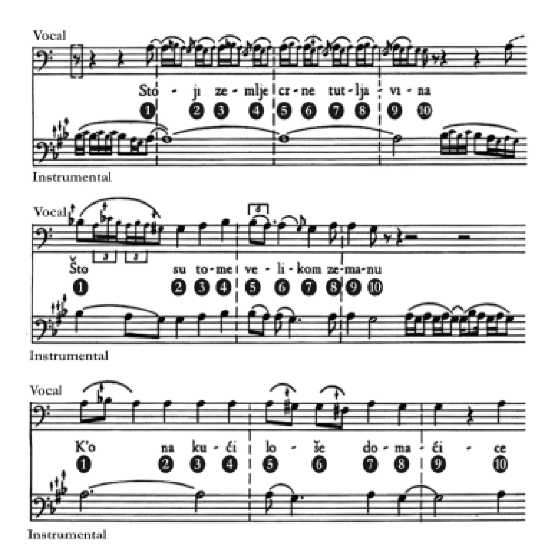
Figure 2. A musical score transcribed from three lines recorded by Parry in 1935 showing each line contains ten syllables. The storyteller would actually sing the lines (top melody) accompanied by a stringed musical instrument called a "gusle" (bottom melody).