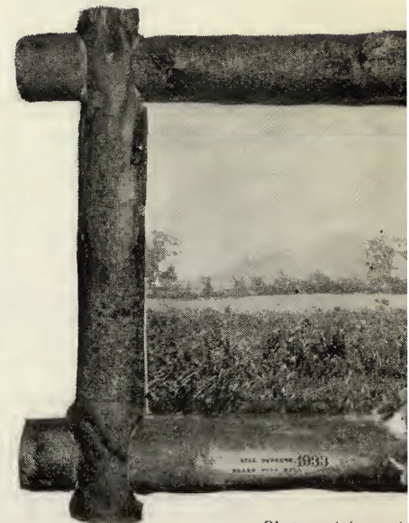
Photo and frame by THE HILL CUMORAH, THE P WOOD FROM THE HILL, P A GIFT TO SUPT. GEOR