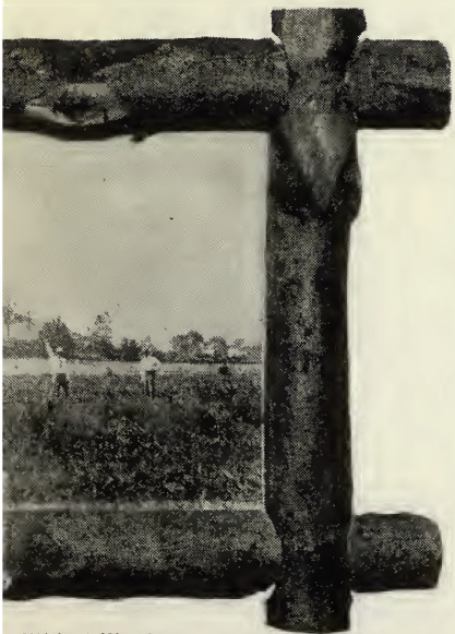
FRAME WAS MADE FROM PICTURE AND FRAME IS BY GEORGE ALBERT SMITH