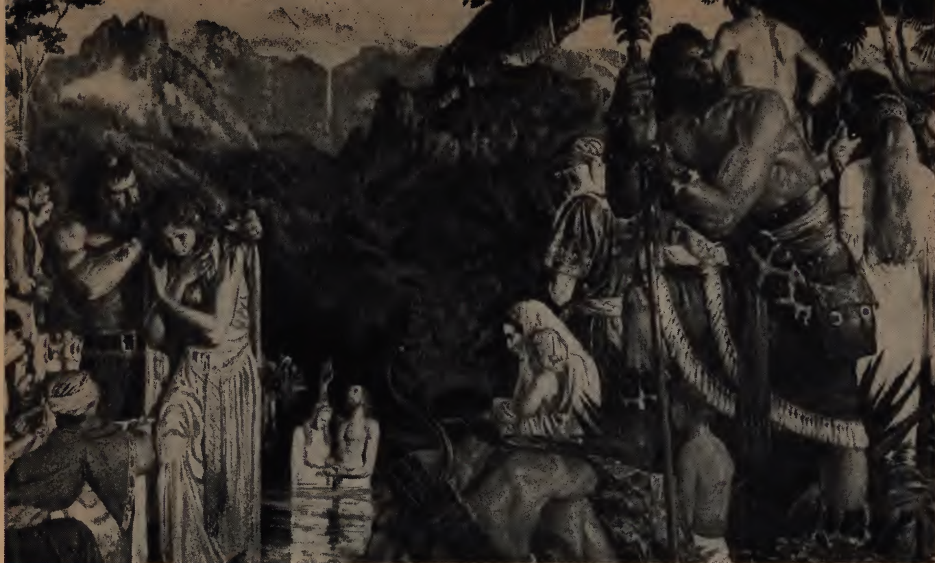
Those who obeyed Alma's teachings were baptized in the waters near Mormon.