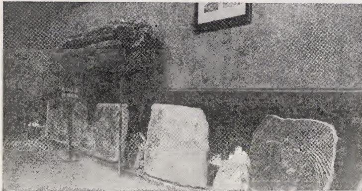
CEMENT BLOCKS IN MUSEUM AT SAN JUAN TEOTIHUACAN

Throughout Mexico and especially in San Juan Teotihuacan which is twenty-eight miles northeast of Mexico City, are found evidences of cement of superior quality. While the modern grades are composed chiefly of coarse gravel with a topping of cement, the ancients used fine sand for their base, effecting a product which has endured for hundreds of years. Added to this, these ancient builders seemed to have perfected also the art of coloring cement, remnants of which are found in numerous places. These huge blocks of cement in the museum at Teotihuacan are covered with hieroglyphics and pictures depicting the art of writing in its primitive form.