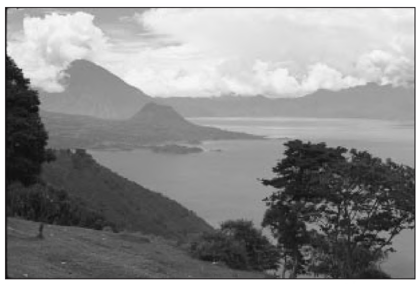
Submerged just off the southern coast of Guatemala's scenic Lake Atitlán is an ancient settlement of stone buildings that suggests an intriguing possible linkage with the Book of Mormon city of Jerusalem, an apostate Lamanite city destroyed by sudden flooding.