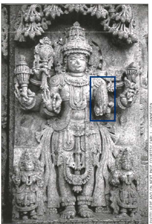
Carvings on Indian temples, like the one above, often show figures holding ears of maize, providing evidence of transoceanic contact in pre-Columbian times.

The evidence for fauna transfer includes infectious organisms. One striking example is the hookworm. Although this organism originated in the Old World, hookworms were found in a Brazilian mummy dating to 5200 B.C. Because of temperature and life cycle limitations, hookworms could not have survived a migration to the Western Hemisphere via the Bering Strait; rather, the only logical explanation for their arrival in the Americas is that they were transported by infected humans traveling on sailing vessels. A few Old World animal species also turned up in the New World,