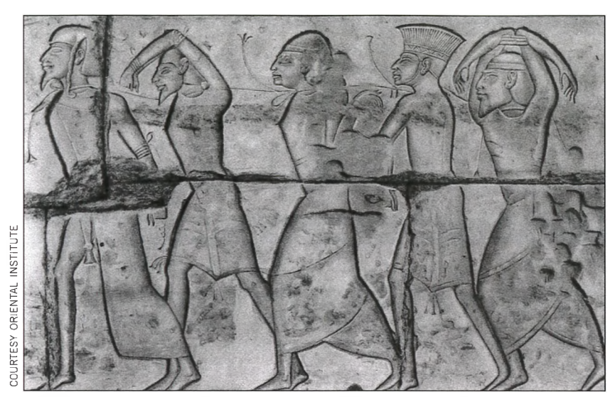
War prisoners of Ramses III being led by cords bound around their necks.