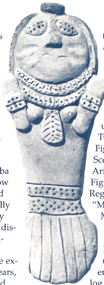
A figurine discovered in the eastern Great Basin, in the area of Utah.

In "Hollow Rattle Figurines of the Otumba Area, Mexico," Otis Charlton describes hollow rattle figurines as "made in a two-piece mold forming a hollow, closed-bodied figure usually enclosing one or more small clay balls." They are categorized as Late Postclassic and were discovered during surveys and excavations conducted in the eastern Teotihuacan Valley of Mexico from 1966 to 1969. Drawing upon the excavation data gathered during those three years, Otis Charlton discusses the chronological and functional associations of these figurines as well as the "social and economic implications of their spa-