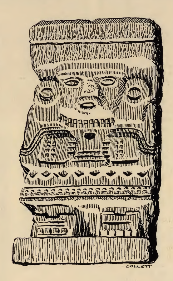
Considerable evidence, internal and external, has been brought to the attention of the world during the past 120 years to substantiate the Book of Mormon. The above is a drawing of the Toltec goddess which stood near the Pyramid of the Moon of Teotihua-

And now, I would prophesy somewhat more concerning the Jews and the Gentiles. For after the book of which I have spoken shall come forth, and be written unto the Gentiles, and sealed up again unto the Lord, there shall be many which shall believe the words which are written. (II Nephi 30:3.)