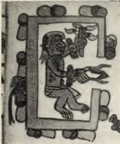
Aztec manuscripts always picture a fasting person seated within an enclosure which represents a house.

"The twelfth [regulation] was that when it was a day of fasting, everybody, both young and old, fasted; they