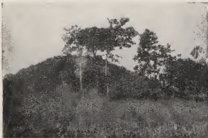
A MOUND STILL COVERED WITH VEGETATION IN HUIXTLA, CHIAPAS.