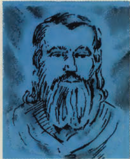
JACOB OR ISRAEL