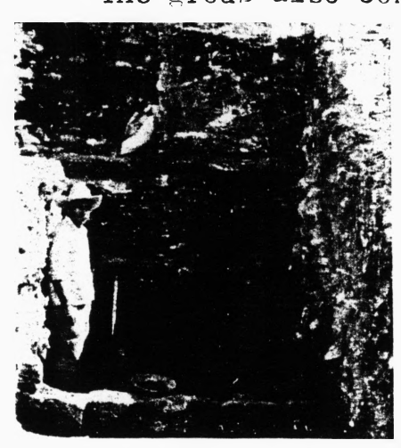
A pyramid of the pre-Classic (Book of Mormon) period at Chiapa de Corzo, perhaps the earliest structure of cut stone yet discovered in southern Mesoamerica.