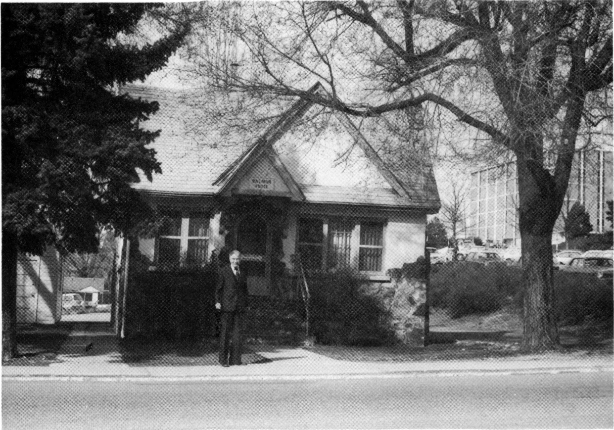
Salmon House on North Seventh East Street, Provo, present home of the Society. Note the huge new John A. Widtsoe Life Sciences Laboratory Building in the background to the right.