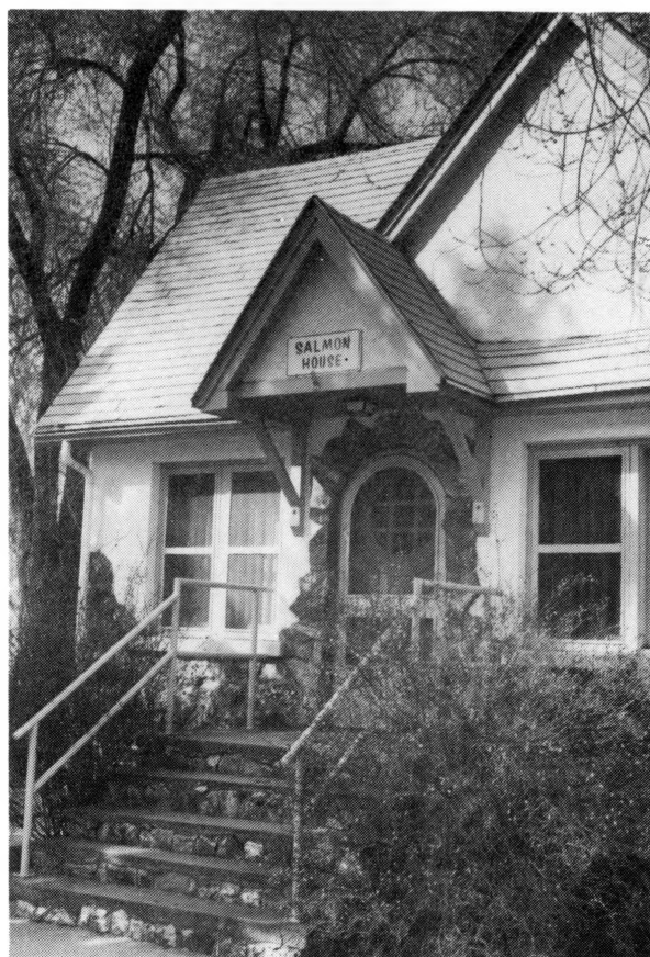
Salmon House.

The former address (c/o Department of Anthropology and Archaeology, 140 MSRB, BYU) should no longer be used. For reasons of economy, however, the present supply of forms and envelopes will continue in use until it is exhausted.