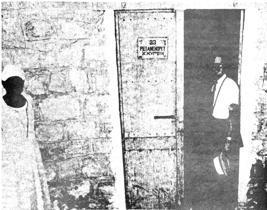
Fig. 3. Dr. Berrett and local guard at the entrance to Tomb 33. Beyond the modern steel doorway is Chamber I (see ground plan, Fig. 1).