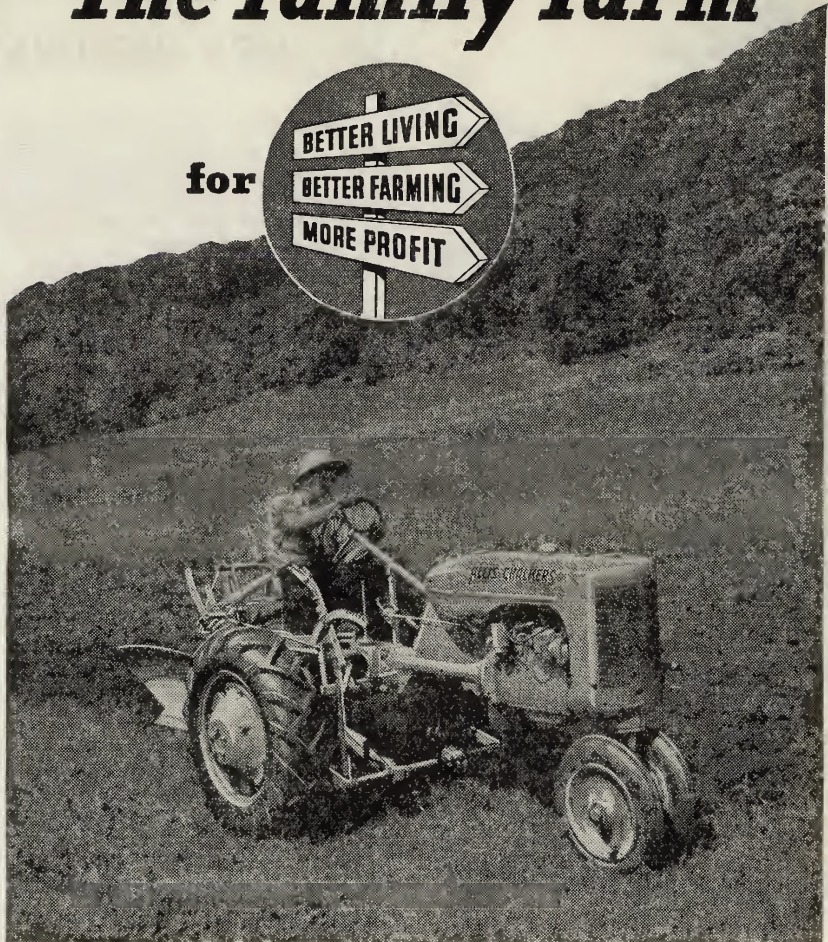
Above—Lapping furrows uphill with 2-Way Pick-up Plow

AT Allis-Chalmers we believe in the farm as a way of life . . . in family-operated farms!