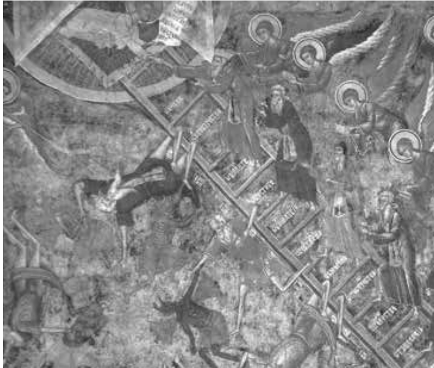
Figure 3. The Ladder of Virtues of St. John Climacus , north façade, Sucevita Monastery, Romania, 1602–1604. 18 Note the sequence of virtues that label each rung of the ladder.

In the tympanum above the central portal of the Strasbourg Cathedral, we see the “ladder” of the Savior’s cross, first as overcoming death and then as opening the way to life eternal. The composition shows three levels: 1. The body of Adam lying in hell with the crucified Christ poised on earth directly above him. The wooden cross, corresponding to a branch of the Tree of Knowledge that (in tradition) was planted in Adam’s grave and became an oil-bearing Tree of Mercy, 19 is the axis that links the worlds of the dead and the living; 2. The cross fleury borne by the victorious Jesus, near a flourishing tree and Adam and Eve clasping hands, provides access to heaven; 3. Jesus ascended, the forerunner of those who are “lifted up” by His cross. 20