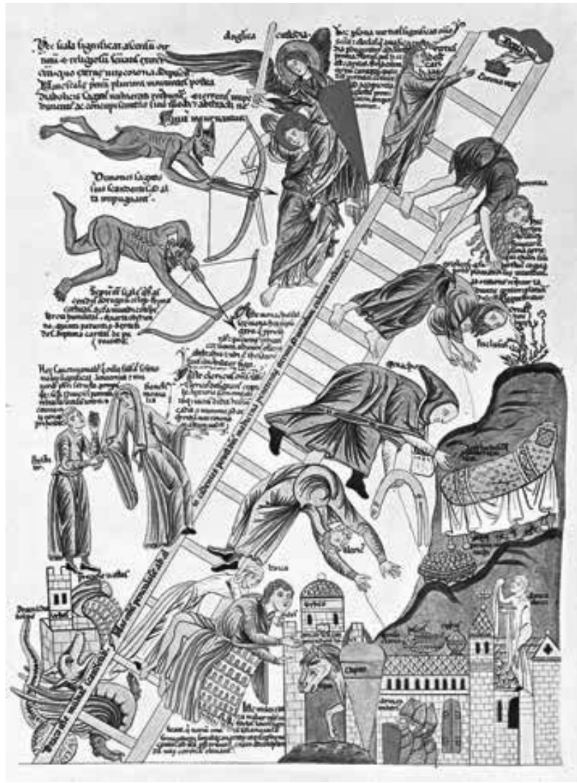
Figure 4. Herrad of Hohenbourg: The Ladder of Virtues , late 12th century CE. The figure of Charity, representing those who have had their election “made sure,” is depicted as having reached the summit of the ladder. Her hand is extended toward the hand of the Lord, shown emerging from a cloud and holding the Crown of Life. Other personages below Charity fall short as they are attracted by one thing or another. The hermit is too busy cultivating his garden and neglects his prayers; the recluse monk longs for sleep; the alms-seeking monk falls for a large basket filled with pieces of silver — what his heart treasures most; the priest’s attention is not occupied by his church but rather by friends, good food and drink, lusts of the flesh, and simony (i.e., the selling of ecclesiastical privileges for money); and the nun chatting with the priest is seduced by the pleasures of the world and by family wealth. Meanwhile, the lay woman (attracted to jewels and beautiful lodgings) and the soldier (tempted by horses, arms, and other soldiers to command) have hardly begun the climb. At the bottom of the ladder, the Devil, whose temptations have ensnared all except Charity herself, appears in the form of a dragon, while his minions take steady aim at their victims with bow and arrow. The caption on the ladder bears a message of encouragement, proclaiming that all those who have fallen will have the opportunity, through sincere penitence, to begin their climb anew. Elaboration of Rosalie Green, Michael Evans, Christine Bischoff, and Michael Curschmann, eds. The Hortus Deliciarum of Herrad of Hohenbourg (London: Warburg Institute, 1979), 2:352-353.