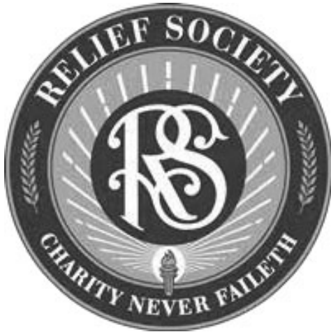
Figure 12. Relief Society Seal. In 1913, Relief Society President Emmeline B. Wells adopted a phrase from 1 Corinthians 13:8 and Moroni 7:46 as a motto for the organization. On 27 April 1842, Joseph Smith had read from 1 Corinthians 13 to the founding sisters.

prepared in the mansions of [His] Father.” 277