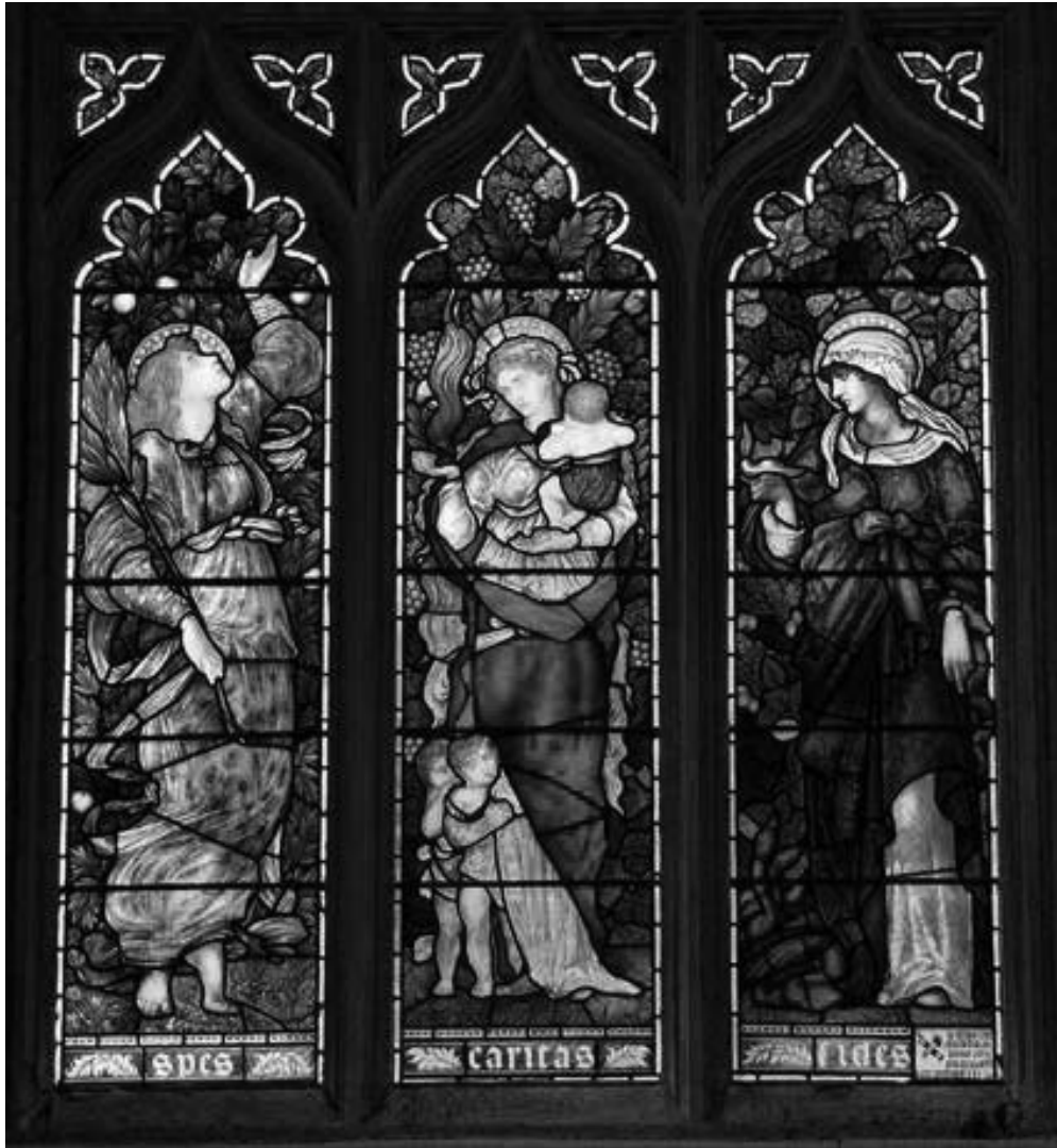
Figure 6. Sir Edward Coley Burne-Jones (1833-1898) and William Morris (1835-1896): Spes, Caritas, and Fides ( Hope, Charity, and Faith ), Christ Church Cathedral, Oxford, England. These three martyred saints, whose common mother was named Sophia (Wisdom) in some accounts, were said to have lived during the reign of the Roman Emperor Hadrian (2nd century CE). 87

virtues and vices that are related to a greater or lesser extent with temple themes and the idea of heavenly ascent. 86