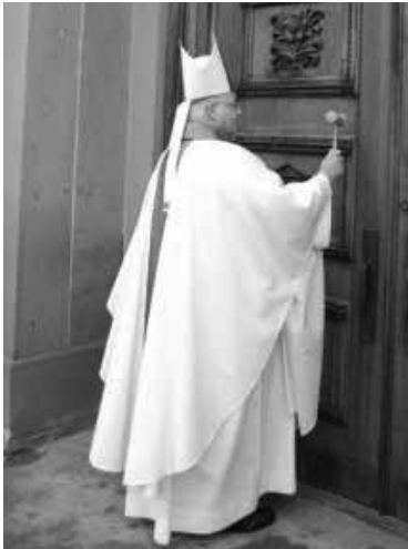
Figure 5. A new bishop knocks three times with a mallet on the door of the Cathedral as part of a Roman Catholic entrance ritual.

likewise that the symbolism of knocking is best understood “in a ceremonial context.” 59 However, it should be remembered that the temple ordinances foreshadow actual events in the life of faithful disciples who endure to the end. 60