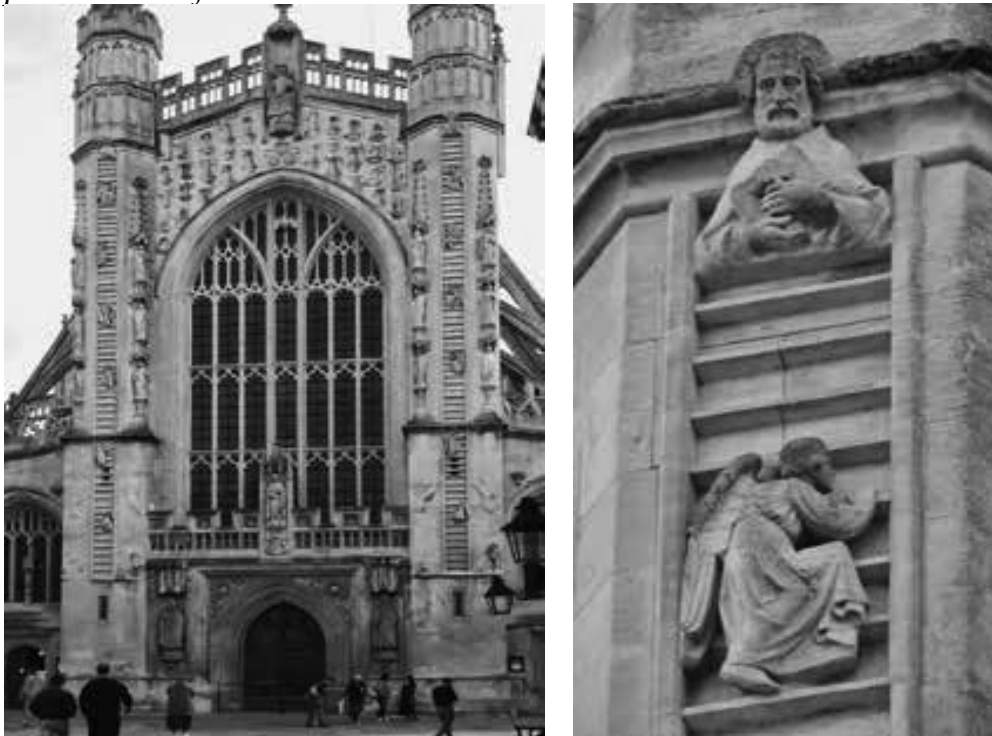
Figure 1. Jacob's Ladder, Bath Abbey, England, 1520.

The story is later referenced in the Gospel of John. Alluding to the multiple deceits practiced in the story of Jacob/Israel and Laban, Jesus praised the approaching Nathanael at their first meeting, saying, “Behold an Israelite [i.e., a descendant of Jacob]...in whom [unlike Jacob himself] is no guile!” 14 Then, referring to the ladder in Jacob’s dream on which angels had ascended and descended, He solemnly asserted His preeminence over the revered patriarch, declaring that He was the ladder of heavenly ascent personified: “Verily, verily, I say unto you, Hereafter ye shall see heaven open, and the angels of God ascending and descending upon the Son of man.” 15