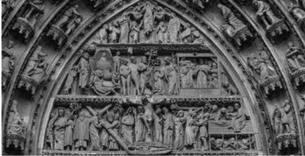
Figure 2. The Ladder of the Cross. Notre Dame Cathedral, Strasbourg, France, 1276–1439. 16

Later, John records a similar declaration: “I am the way , the truth, and the life: no man cometh unto the Father, but by me. ” 17