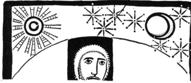
Figure 11. Heavenly Ascent of Moses (detail), Showing Laddered Sun with Moon and Stars. 268