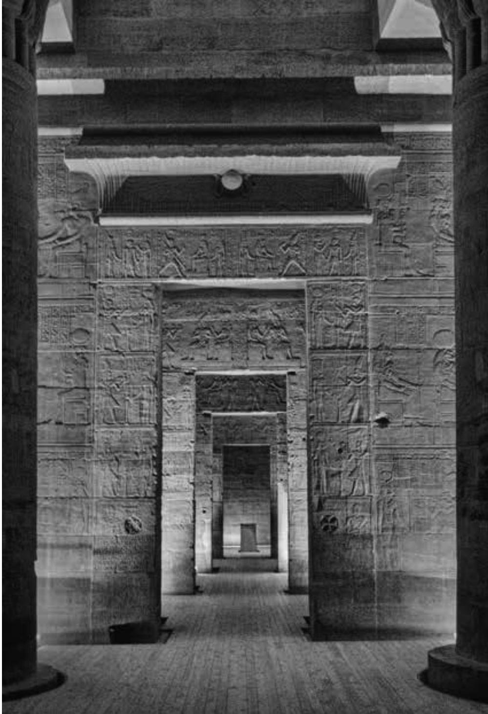
Figure 13. Temple of Isis, Philae, Egypt, 380–362 BCE. Passage through an ascending sequence of spaces of increasing holiness by means of a series of narrow doors or gateways is a near-universal feature of ancient temples. The degree of sacredness and the difficulty of access increases as one approaches either the innermost or topmost space.