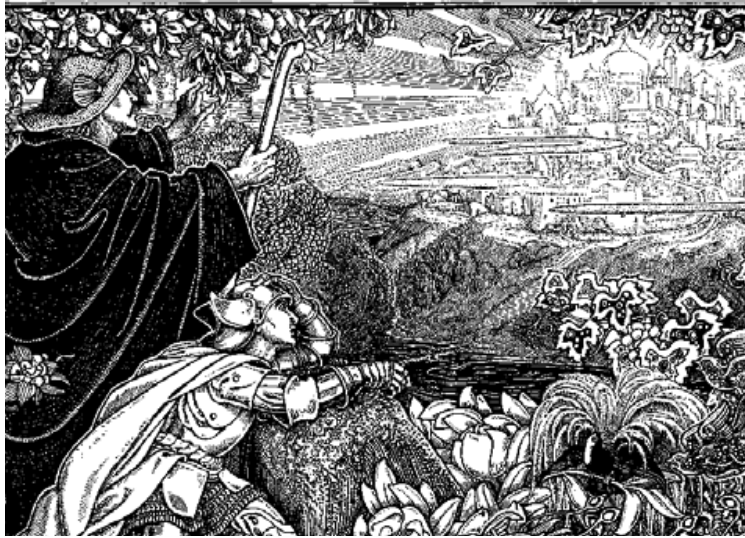
Figure 10. John Bunyan (1628-1688), The Pilgrim's Progress : “There [is] a way to hell, even from the gate of heaven” 254 Artist unknown.

Before proceeding to his final summation of the doctrine of Christ and his description of the end of the path of eternal life, Nephi writes the following by way of similar solemn warning: 255