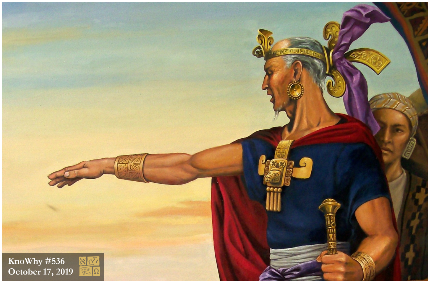
"El rey Benjamin 2" by Jorge Cocco