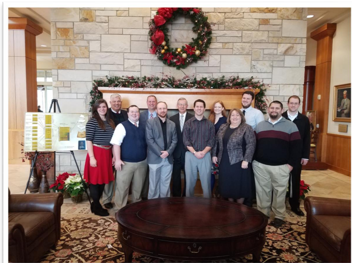
Book of Mormon Central Staff December 2016

Book of Mormon Central is fortunate to have devoted, informed, and talented volunteers such as you, the readers of this newsletter. Please send us a report on Book of Mormon events you have attended or have been involved in that would be of interest. We would love to post that information in this newsletter.