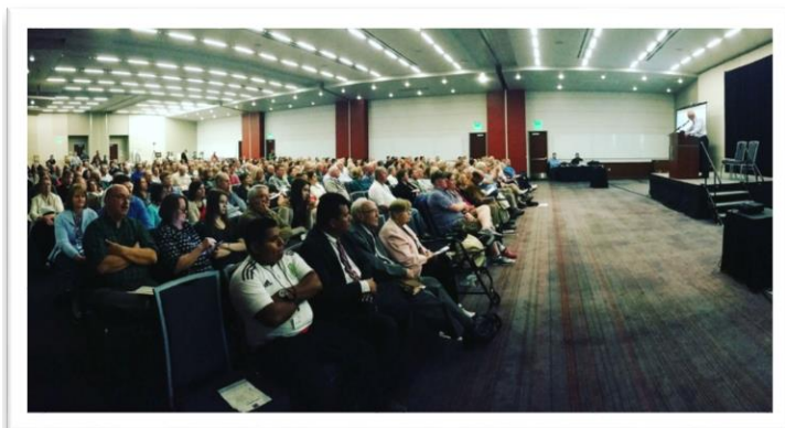
BMAF – BMC Conference 2017

The annual BMAF/BMC Conference was held Saturday, March 18 th at the Utah Valley Convention Center. See the schedule and list of speakers here. The conference auditorium was almost filled to capacity, making this the most highly attended BMAF conference yet (nearly twice the attendance of prior conferences). We hope to