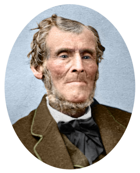
The Three Witnesses of the Book of Mormon Compilation retouching and colorization by Bryce M Haymond