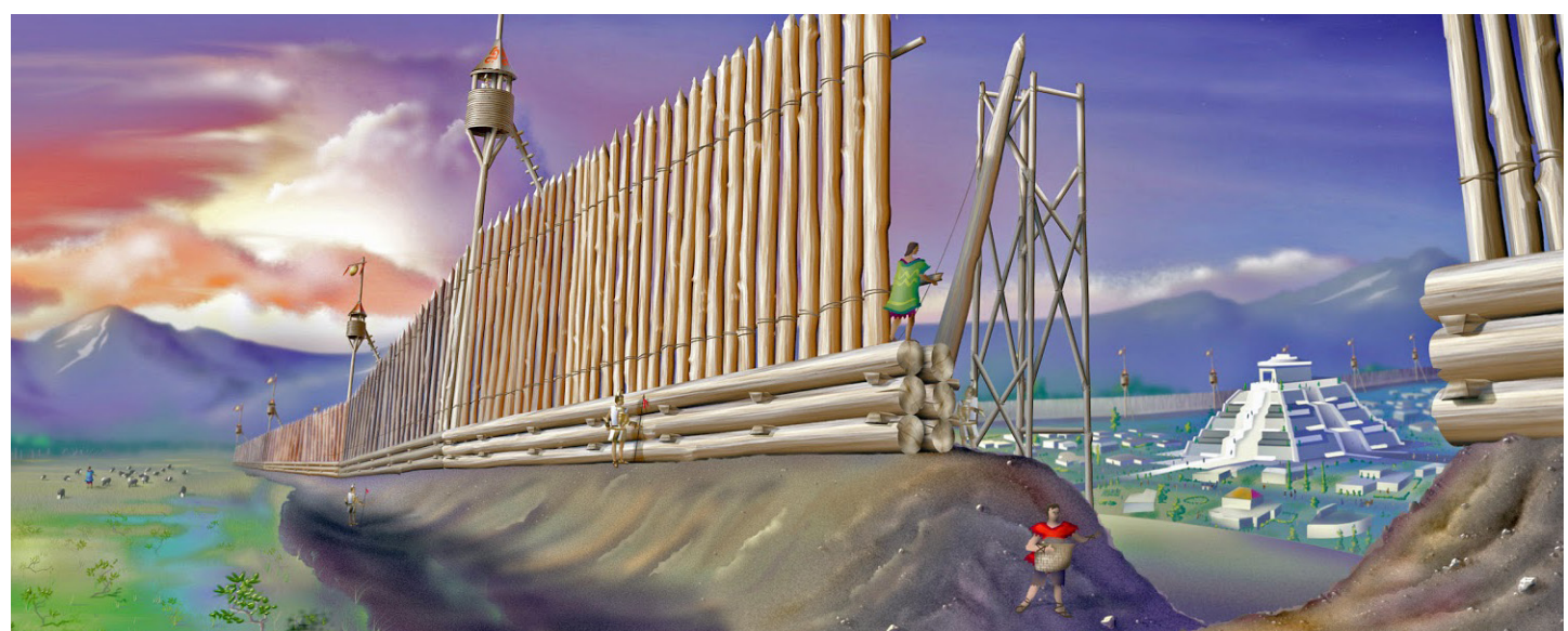
Captain Moroni's Works of Timbers via brunson20.com

As the frequency and complexity of war increased, there became a greater need for the Nephites to fortify themselves against Lamanite attacks. Under these circumstances, Moroni did not settle for simple or basic