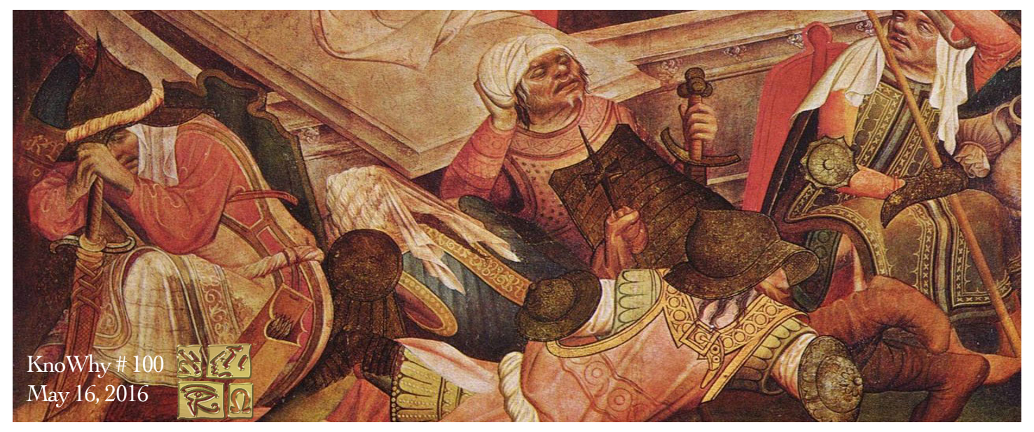
Sleeping guards (detail of the Resurrection of Christ) by Meister Francke