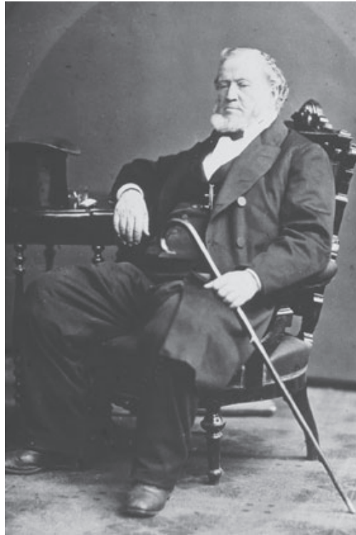
Brigham Young at approximately age seventy-five.