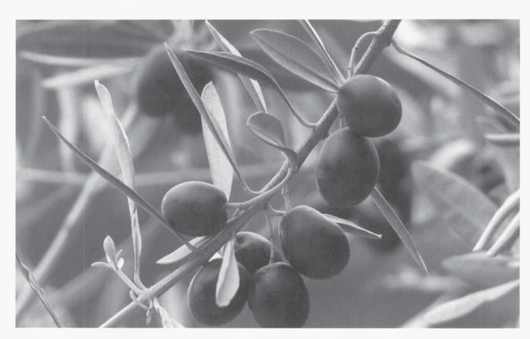
The branches represent individuals and families which are able to bring forth fruit.

as I suggest in this paper: as a dual representation of the Church, where the branches stand for the members and the roots symbolize the Church as an institution with its priesthood channels.