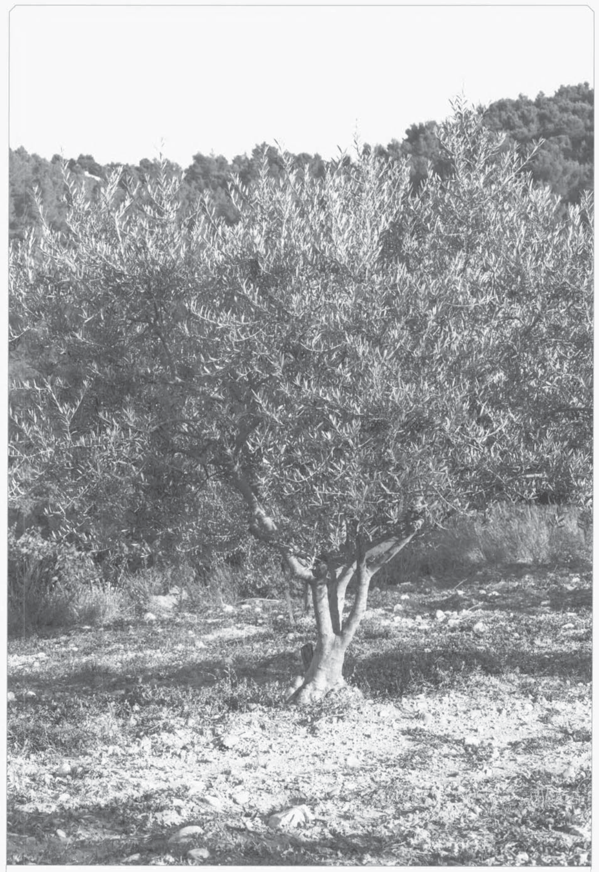
"Thus saith the Lord, I will liken thee, O house of Israel, like unto a tame olive tree, which a man took and nourished in his vineyard" (Jacob 5:3)