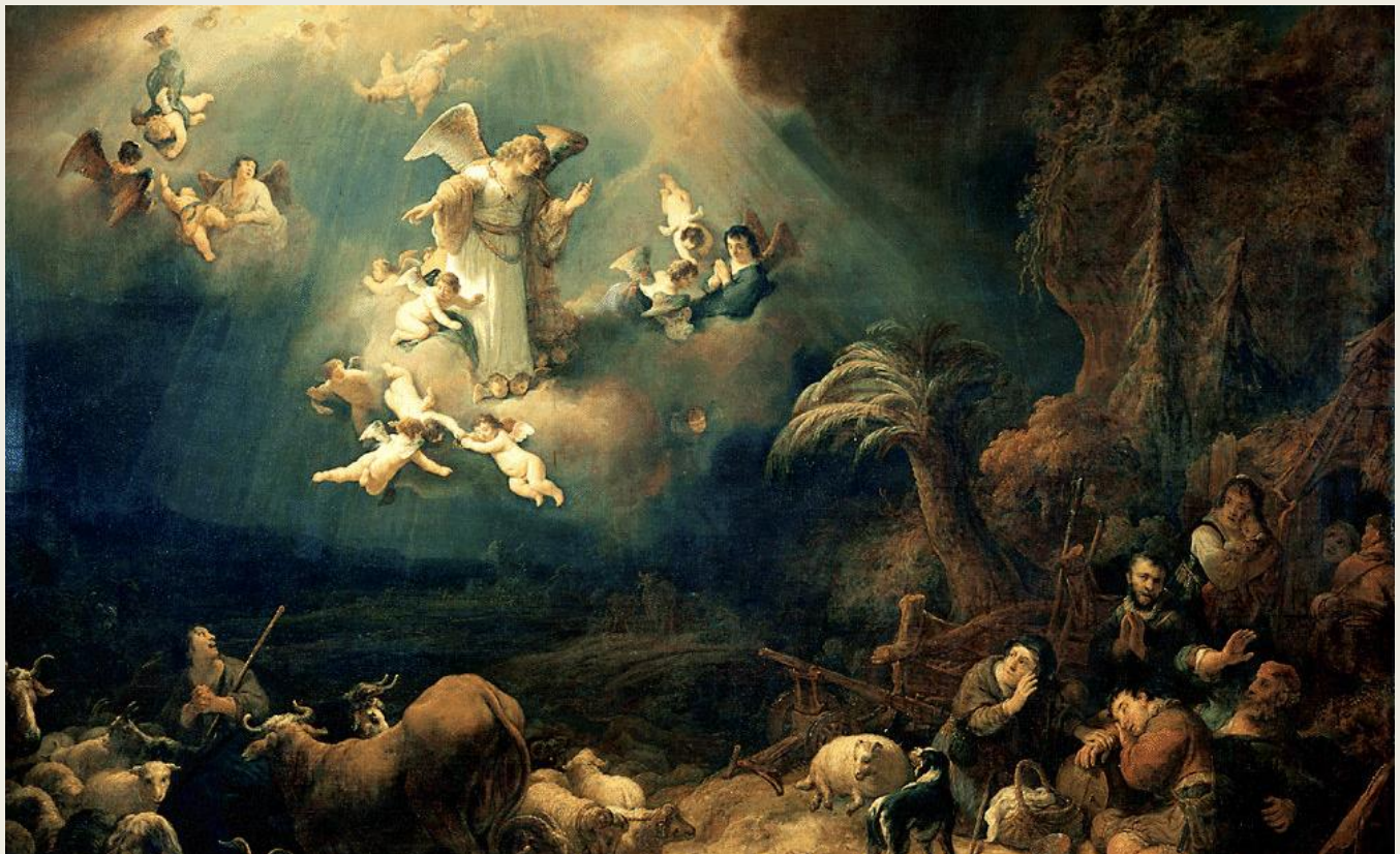
Angels announcing Christ's birth to the shepherds by Govert Flinck.

Archeologists have found one khan in Bethlehem. The problem was not of insufficient space but of a proper place. The courtyard probably could have fit another mat among the throngs. But Joseph and Mary's needs were different than just a traveler seeking a place to lay down. Divine intervention prevailed in finding their lodging away from the crowds for Mary's delivery. We see an ironic pattern throughout Christ's ministry and beyond as so few find room in their hearts for Him.