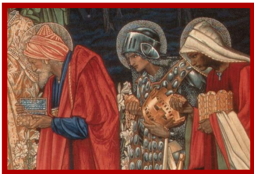
Detail of The Adoration of the Magi by Edward Burne Jones.

Mt 2:9–10 The star that the magi saw at its rising has reappeared now over Bethlehem. The scriptures describe a star that they saw once reappearing to led them from Jerusalem to Bethlehem.