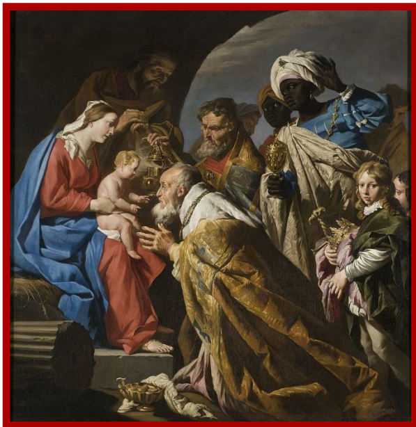
The Adoration of the Magi by Matthias Stom.

Mt 2:4 The Chief Priests were the captains of the temple. The scribes—also known as lawyers (NEB) and teachers of the law (NIV)—developed the Mosaic and oral laws in detail and applied them to the circumstances of their time. They represented the Sanhedrin, or leadership body of the Jews. At the time of Jesus' birth, Herod the Great had decimated the Sanhedrin to a mere shadow of its former (and future) existence.