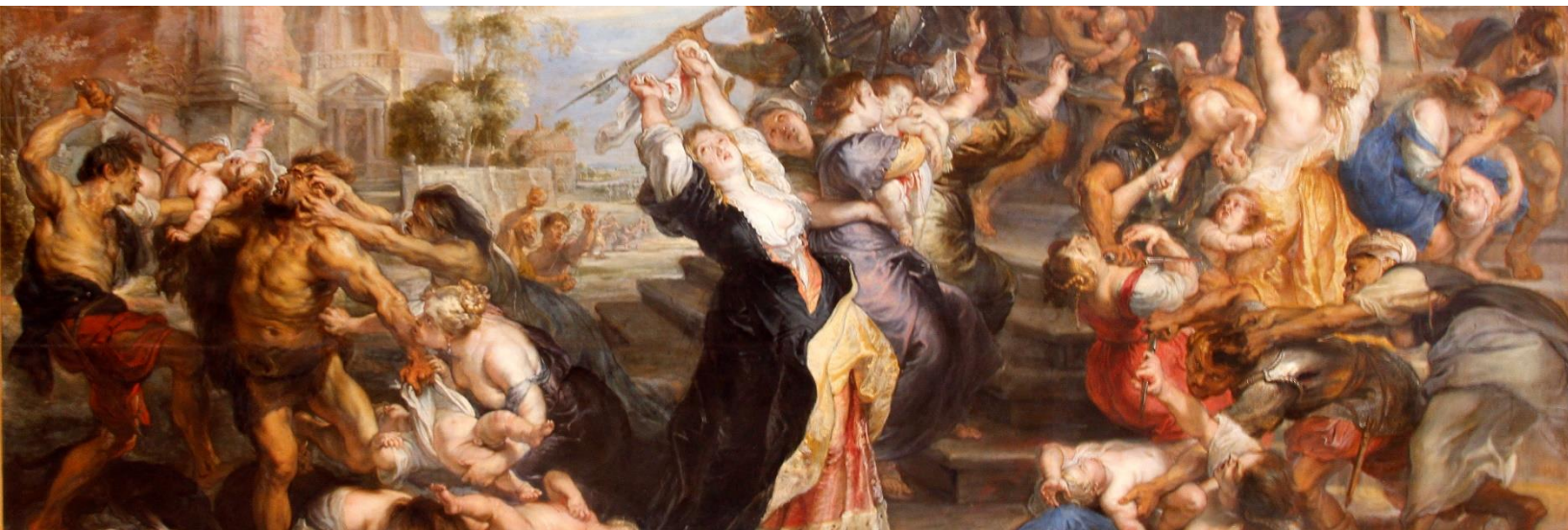
Massacre of the Innocents by Peter Paul Rubens.

Matthew's last three Old Testament quotations (2:6, 2:15, and 2:18) offer an overview of the history of Israel in geographical miniature. By mentioning Bethlehem as the city of David, Egypt as the land of the Exodus, and Ramah as the mourning place of the Exile, Jesus' early life is summed up in the history of these prophetically significant places. "All things which have been given of God from the beginning of the world, unto man, are the typifying of him" (2 Nephi 11:4).