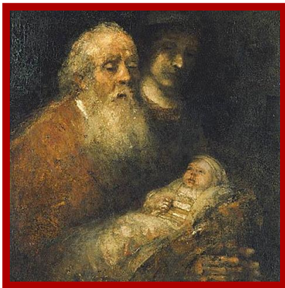
Simeon in the Temple by Rembrandt.

Lk 2:28–32 The scene includes the beautiful diversity of Simeon at the end of his life holding a child that is just beginning his life. Simeon’s prophecy has become famous in the mass as its Latin first words, Nunc dimittis . The poem speaks of joy and peace by highlighting the watchman and the aged. Simeon describes himself as a “servant / doulon ,” just as Mary does in Luke 1:38, “handmaiden / doule / servant / slave.” As a devoted servant Simeon addresses God as his “mighty Master.” Simeon’s message testifies of God’s foreknowledge and carrying out of His plans. He quotes portions of scripture including Isaiah 52:10; 42:6; 46:13; and 60:1. He includes gentiles as well as Israelites as those who will be blessed from this child’s life.