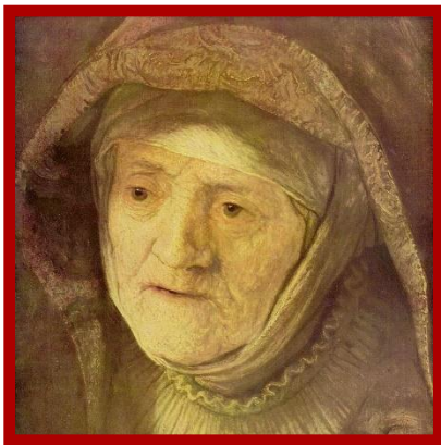
The prophetess Anna by Rembrandt.

Lk 2:36–38 The female and second witness in this scene is the prophetess Anna (or Hannah in Hebrew), whose name means, “Grace or Favor.” She has several unique traits: She is from the tribe of Asher, a prophetess, over one-hundred-years-old, and speaks as a female witness. In the late second temple, Jewish women were not allowed to speak as a legal witness—but that is changed by Jesus and in Christianity where women are regularly shown as witnesses. 31 Anna is the forerunner of the Jerusalem Christian community in her fasting and prayer in the Temple setting (Acts 2:17, 46). Luke also uses his numbers carefully by offering his audience three double witnesses plus Mary, for a total of seven voices proclaiming Jesus as the Messiah. These witnesses embody all devout believers waiting for the fulfillment of the covenants of Israel.