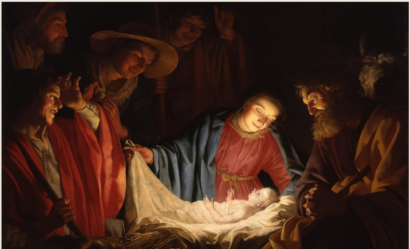
Adoration of the Shepherds by Gerard von Honthorst.

Glory in the highest to God, and Peace on earth among men favored (by Him)