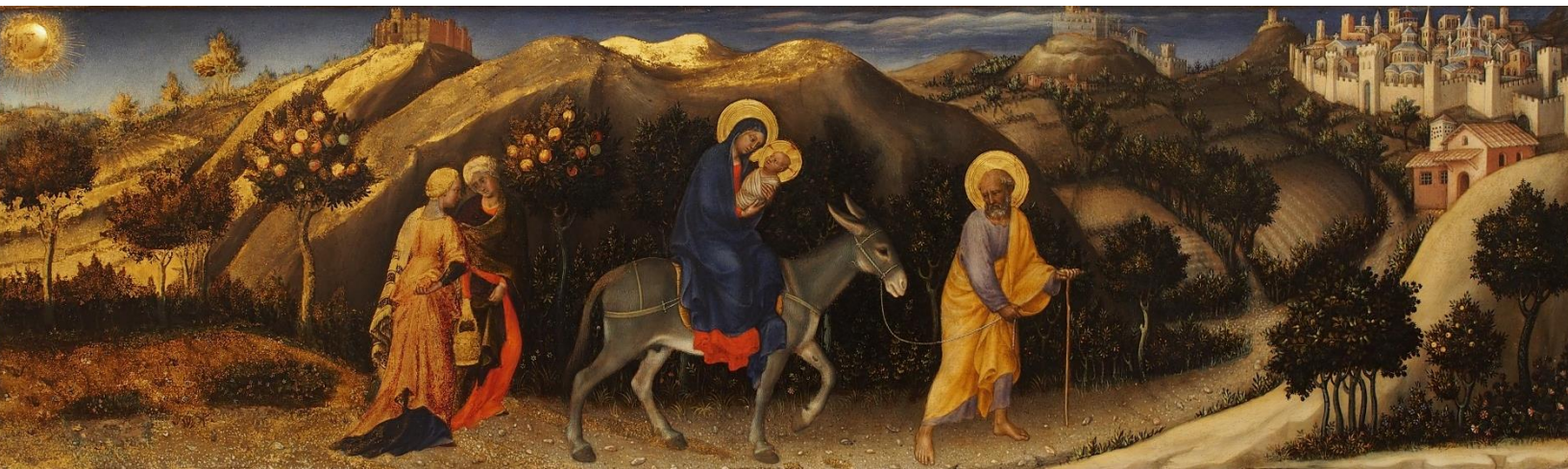
Scene of Flight in Egypt by Gentile da Fabriano.

Mt 2:15 Nowhere in Matthew’s Gospel are his OT quotations so closely placed as in 2:15–23 where they constitute about one third of the content. Where this OT quotation comes from is not clear—it may be Hosea 11:1 or Numbers 24:7–8. On the most fundamental level, the Hosea passage refers to the Exodus of Israel from Egypt.