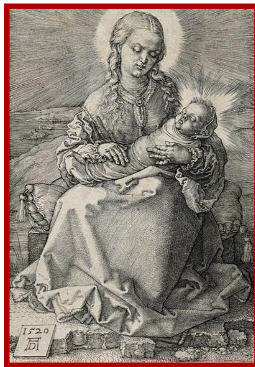
The Virgin and Child in Swaddling Clothes by Albrecht Dürer.

The Greek word, “ phatne / manger,” can mean a stall for tying up animals, or trough for feeding them. Troughs were either a low rock shelf in a cave, or a moveable large rock with a section carved out for feed. The manger was emphasized as a fulfillment of Isaiah 1:3; “The ox knows its owner, and the donkey knows the ‘ phatne / manger’ of its lord, but Israel has not known me” (Septuagint, LXX). This also foreshadows Jesus’ mission: “the Son of Man hath not where to lay his head” (Matt 8:20), and his last supper—which was also in a katalyma / inn / guest room (Luke 22:11).