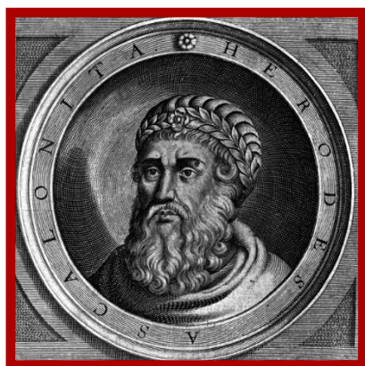
Herod the Great.

Herod represented three of the Semitic races, two by birth (Edomite and Ishmaelite), and the third by his feigned allegiance to the Law of Moses (Jew). Nonetheless, his conceptions of governmental policy were completely Roman, and his ideal of life and enjoyment were entirely Greek. At twenty-five, energetic and athletic, Herod became the governor of Galilee and subdued the unrest there. In 40 BC he went to Rome where Antony and Octavius appointed him King of Judea. However, the Jewish people did not welcome him as their king. He fought the Jews for three years, married Mariamne I, a princess from the Hasmonean family (only to kill her later as he realized she and her children had more of a right to the throne than he did). Finally, in 37 BC he gained possession of Jerusalem. 32 A masterful politician, Herod maintained favor with the Roman rulers, but his devout Jewish subjects utterly despised him. He was most known for his paranoid jealousy that led to a brutal reign, and his grandiose building projects. 33