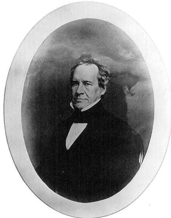
Charles Anthon (1787-1867), a professor of classical languages at Columbia College (now Columbia University) in New York from 1820 to 1867. His library in 1828 included recent works on hieroglyphic and demotic Egyptian.

THE REORGANIZED CHURCH OF JESUS CHRIST OF LATTER-DAY SAINTS possesses a handwritten