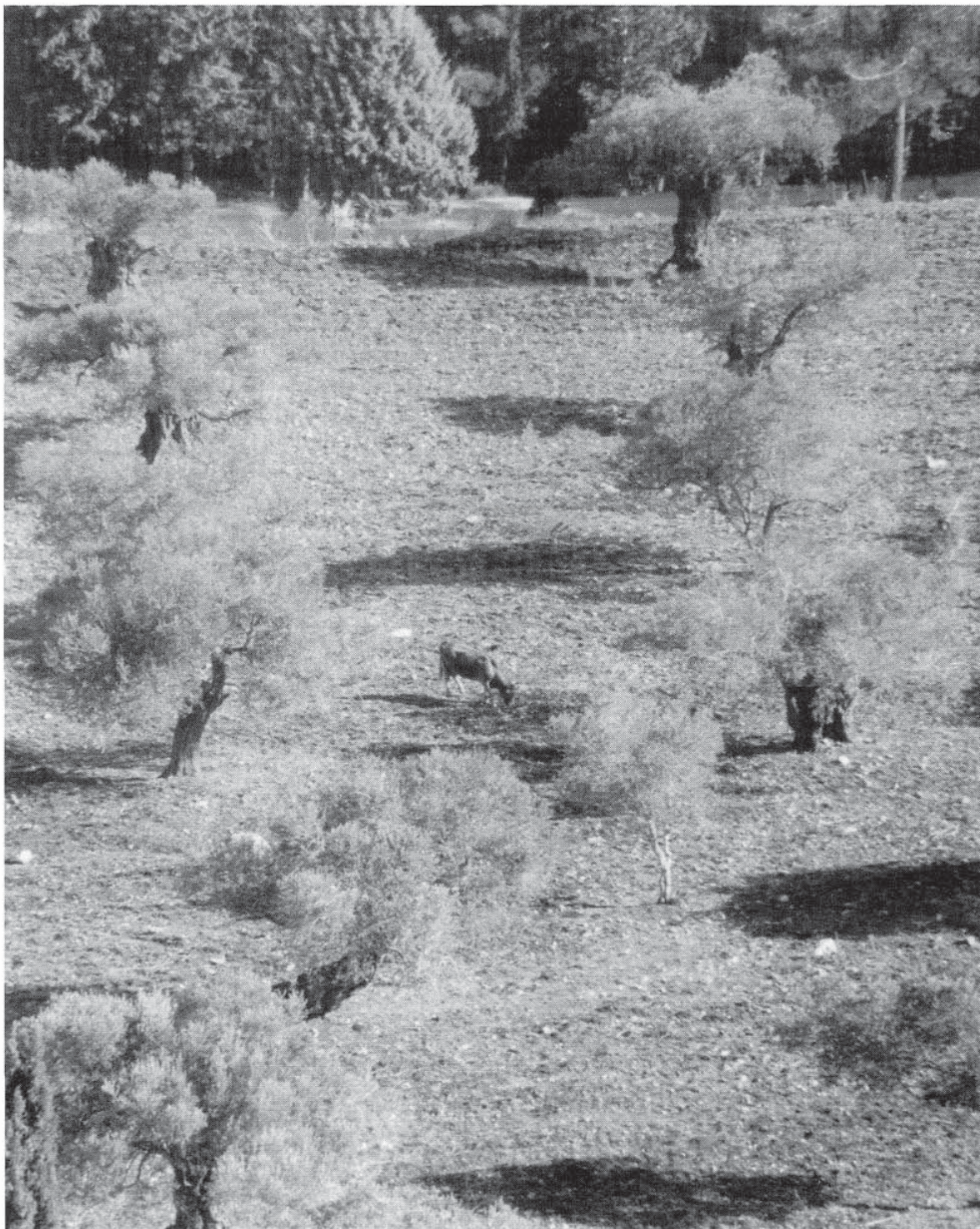
FIG. 3. These olive trees stand on a hillside in the eastern Mediterranean region, a major olive-producing area for centuries. These trees have been planted with room for growth and cultivation. Olives flourish in rocky areas with ample light and adequate moisture. Regular pruning is required, and good orchards are kept free from weeds and trimmings.