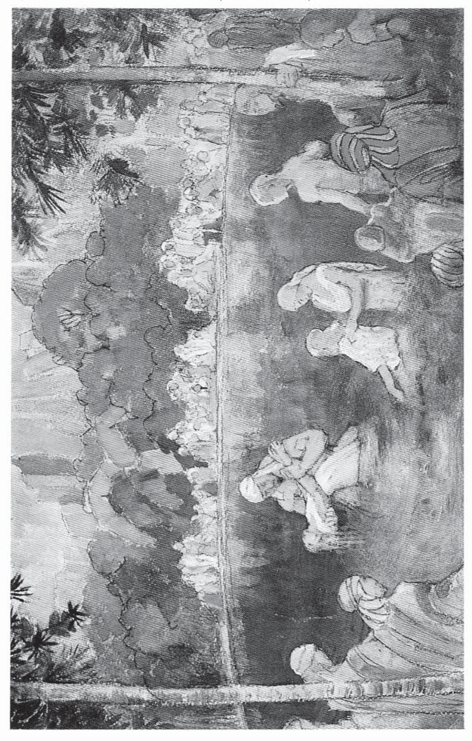
Minerva H. Teichert, Alma Baptizing