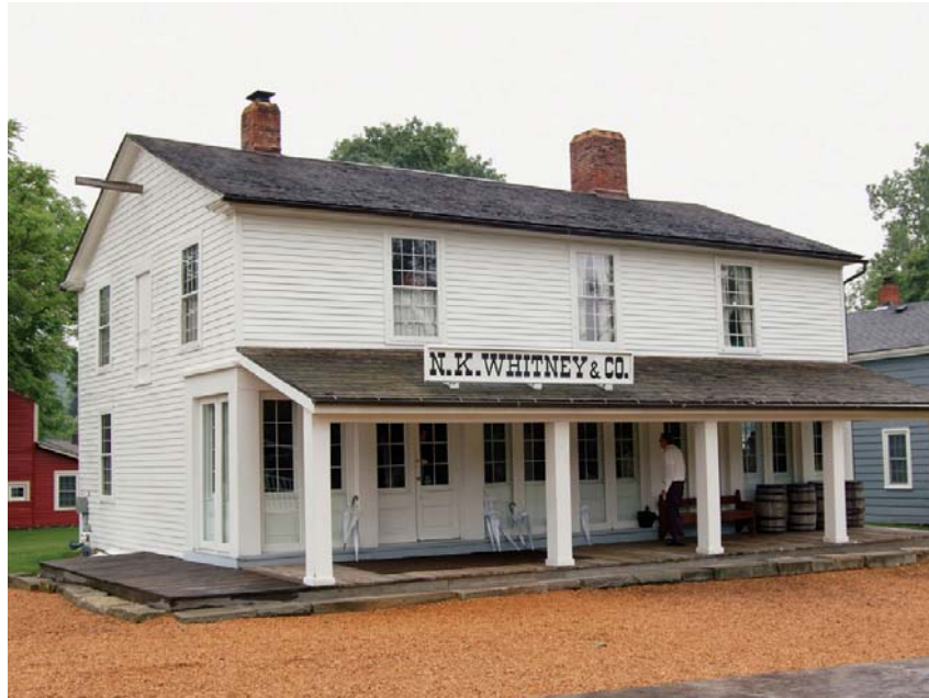
Newel K. Whitney store in Kirtland, Ohio.