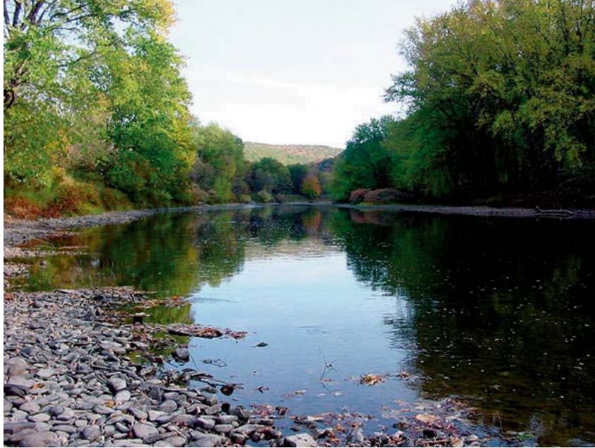
Susquehanna River near Harmony, Pennsylvania.

1829 British Parliament gave Catholics full political rights in Great Britain.