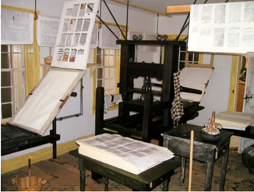
Printing Press in the Grandin Building, Palmyra, New York.