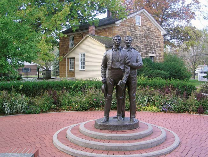
Statue of Joseph and Hyrum Smith at Carthage Jail.

his interactions with Governor Ford. ♦ Personal Writings of Joseph Smith , 620–23