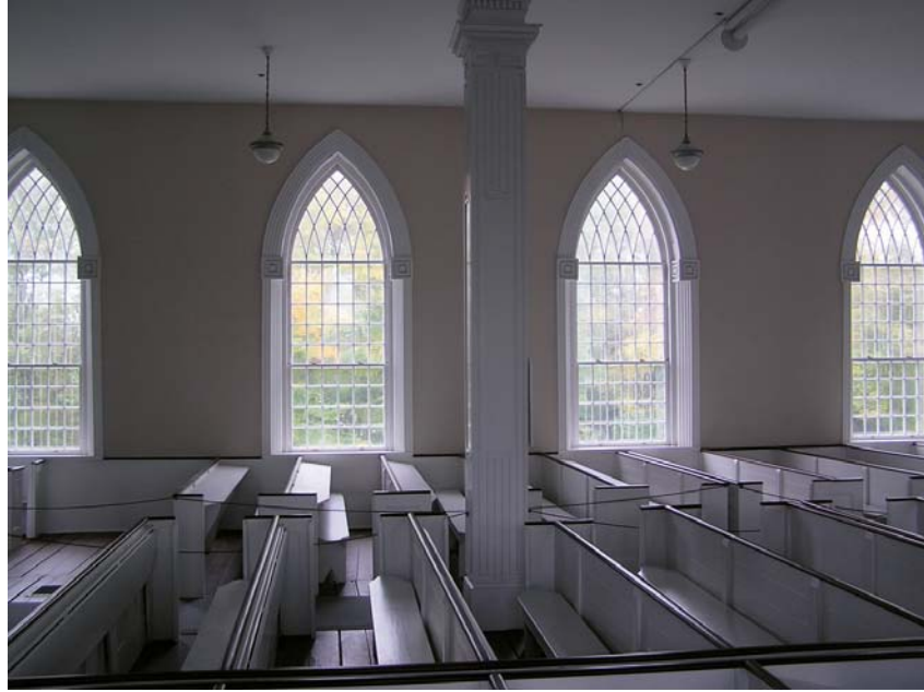
Kirtland Temple interior.

1836 Ralph Waldo Emerson published his essay Nature , making him the central figure of the Transcendentalists.