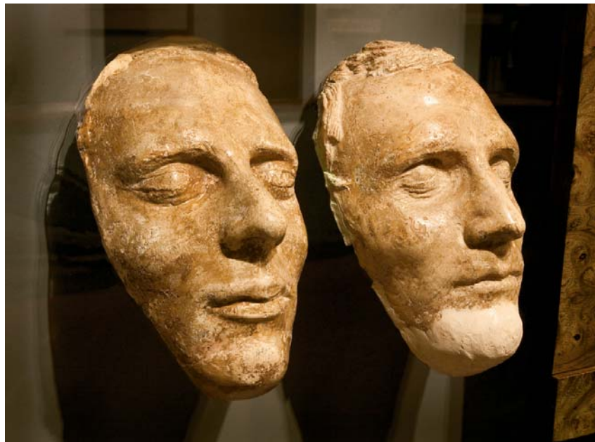
Death masks of Joseph and Hyrum Smith.

Brigham Young was chosen to lead the Church.