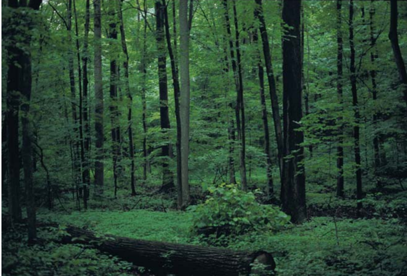
The Sacred Grove.