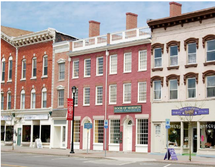
Grandin Building, Palmyra, New York.