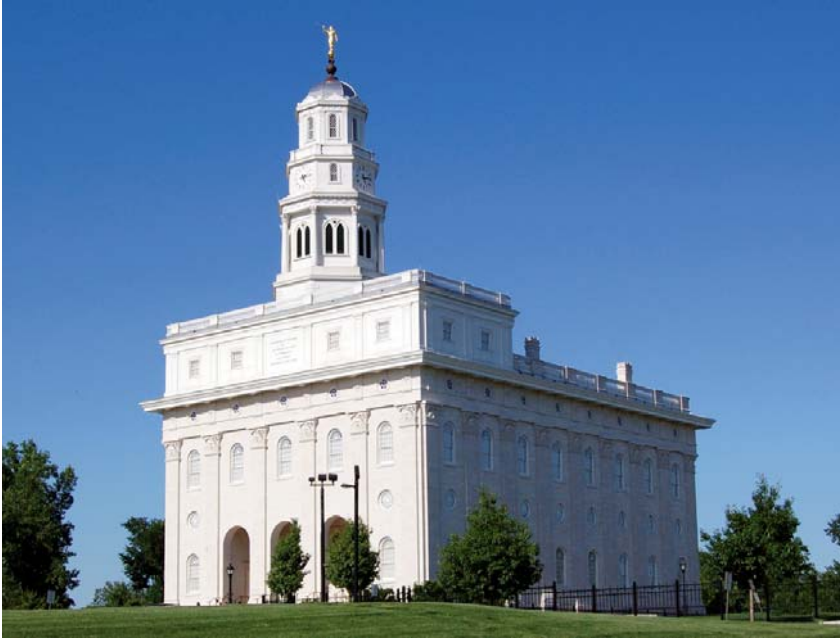
The Nauvoo Temple, rebuilt 1999–2002.