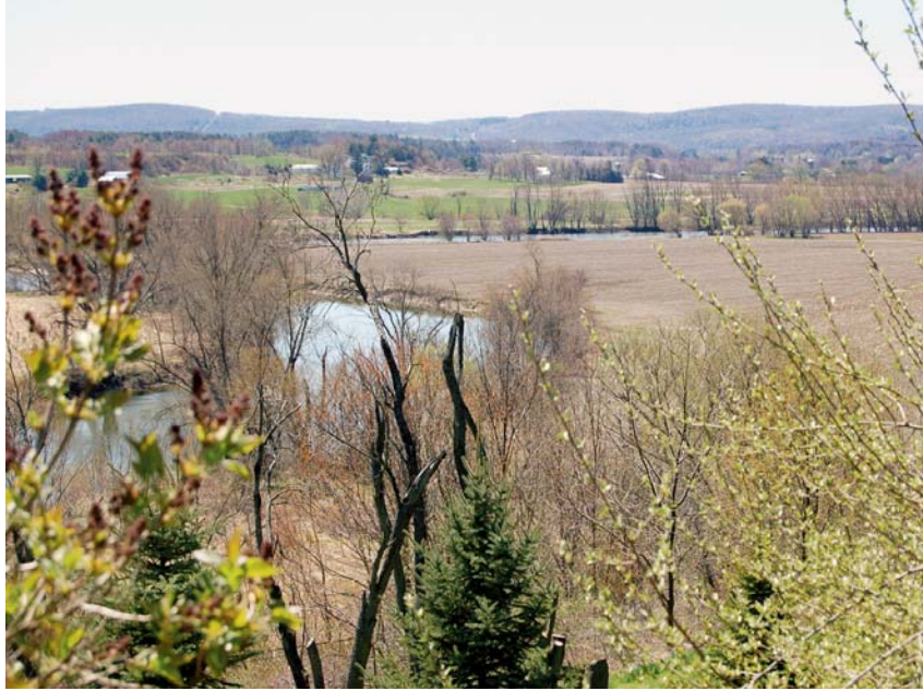
Colesville, New York.

May 28, 1830 President Andrew Jackson signed the Indian Removal Act, forcibly removing tens of thousands of Native Americans to the West.