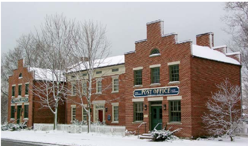
The Nauvoo post office.

The Fleet Prison for debtors in London was abolished.