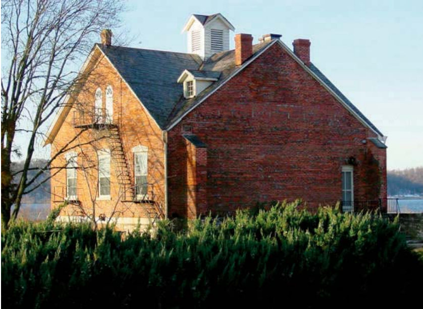
The Nauvoo House.