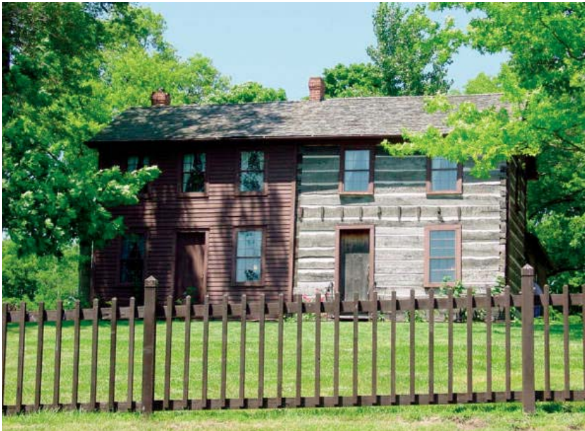
The Joseph Smith homestead in Nauvoo.

The afternoon tea ritual was introduced in Britain by the Duchess of Bedford.