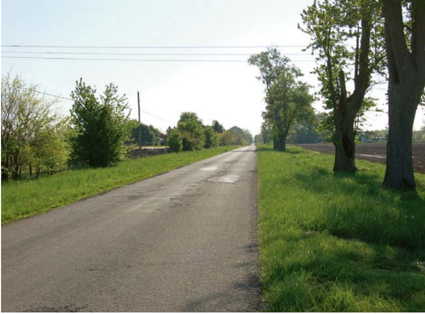
The National Road between Ogden and Raysville, Indiana. Zion's Camp followed this road for part of its trek.