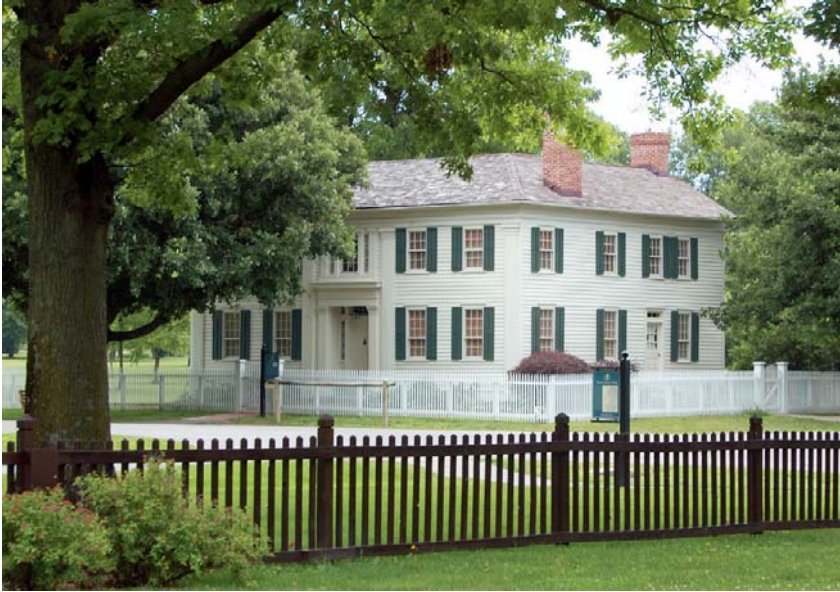
The Mansion House in Nauvoo.