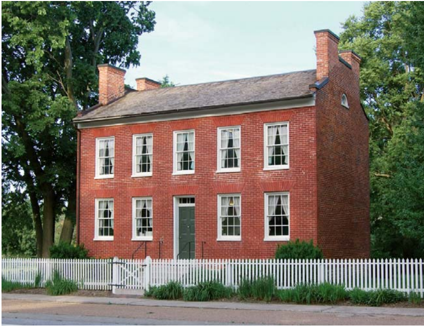
The Wilford Woodruff home in Nauvoo.