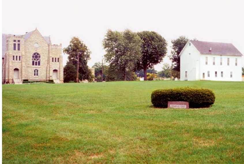
Temple lot in Independence, Missouri.