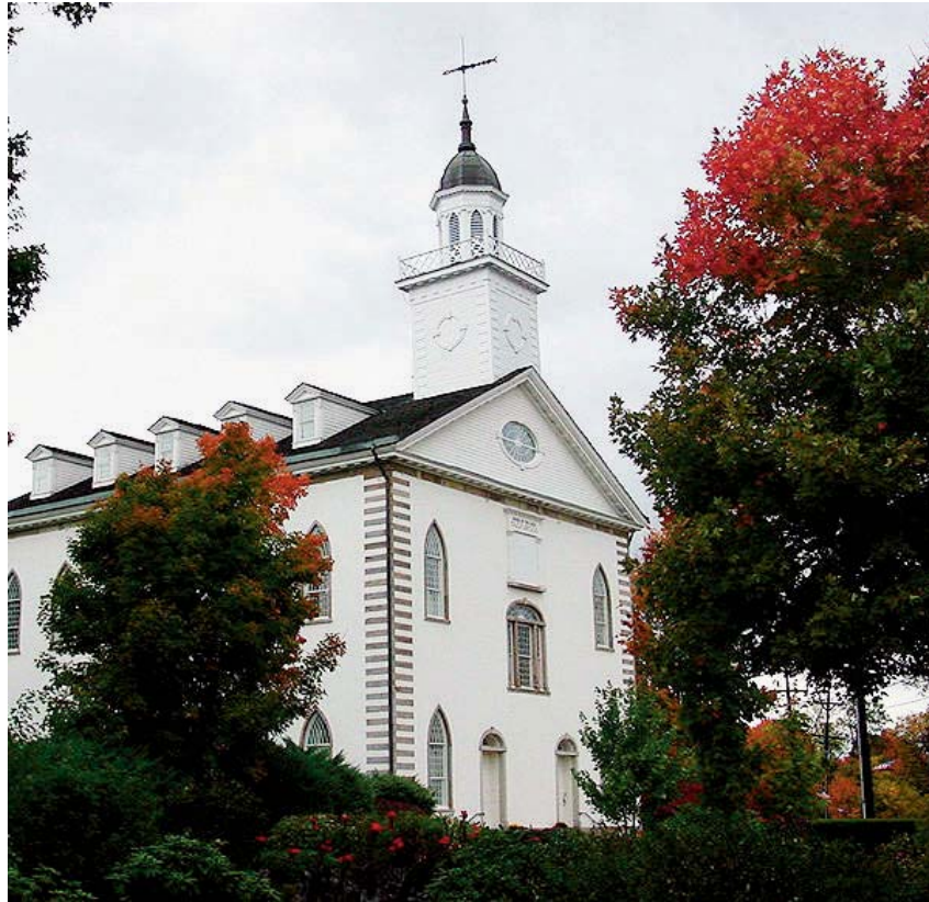
The Kirtland Temple.

1833 The Whig Party was established in the U.S.