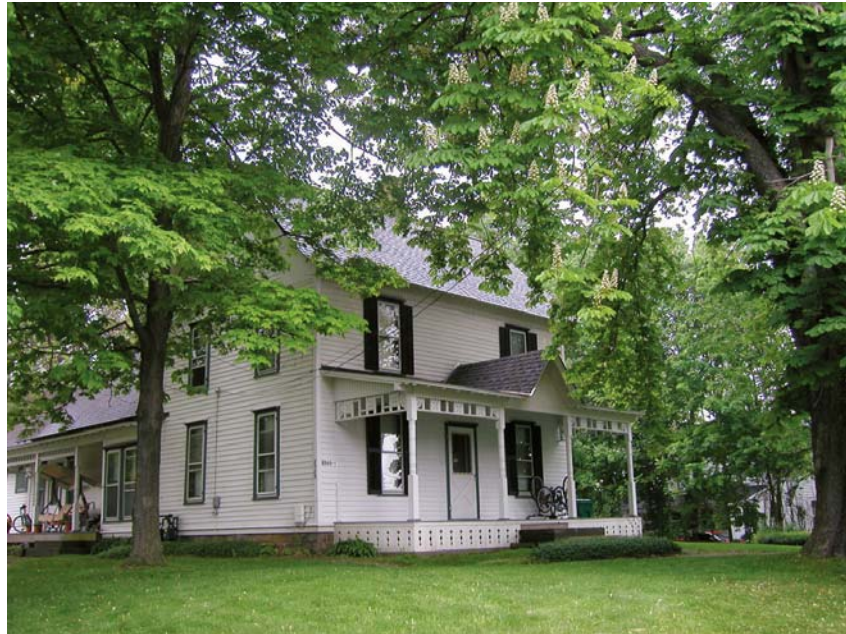
Joseph Smith's home in Kirtland, Ohio.