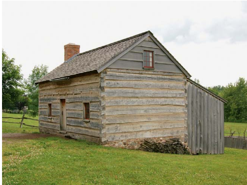
Replica of the Smith family log home in Palmyra, New York.

Dec. 2, 1823 The Monroe Doctrine, proclaiming that European powers should not colonize or interfere with countries in the Americas, was issued.