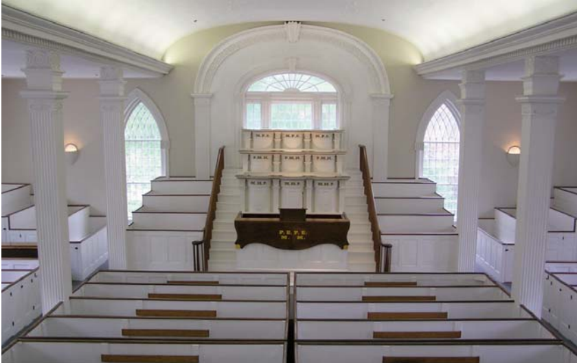
Kirtland Temple interior.