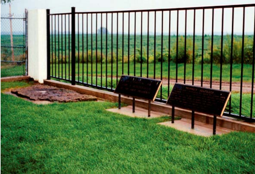
Southeast cornerstone of the Far West Temple that was never built.