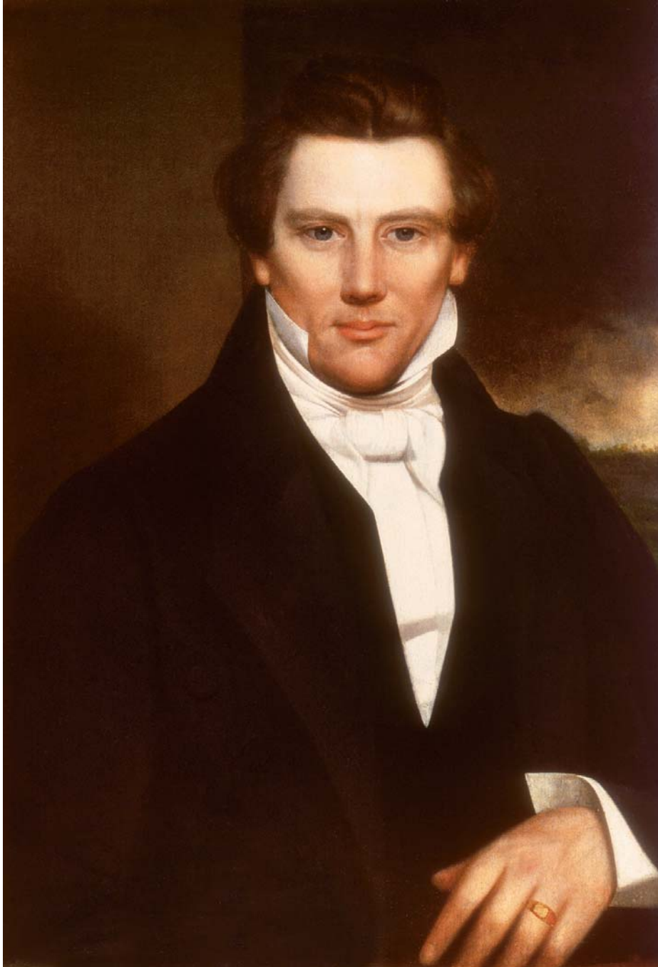
Joseph Smith, artist unknown, circa 1842.