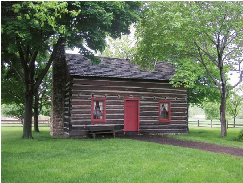
Replica of the Peter Whitmer home in Fayette, New York.