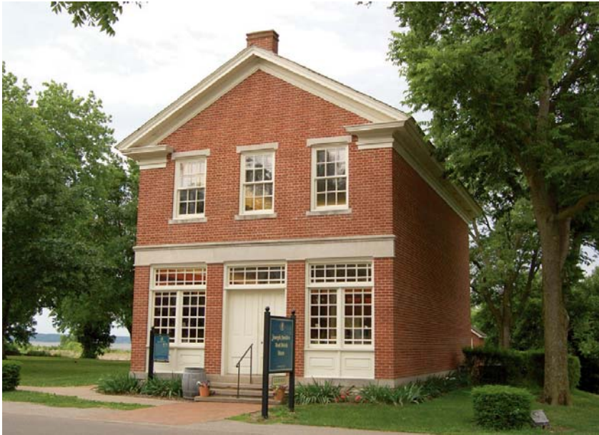
Joseph Smith's Red Brick Store in Nauvoo.