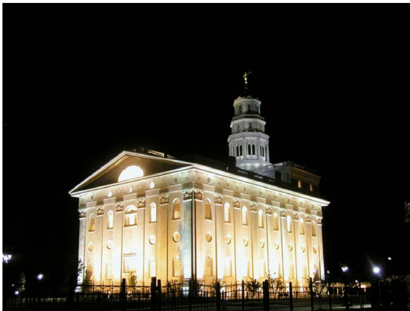
The Nauvoo Temple at night.