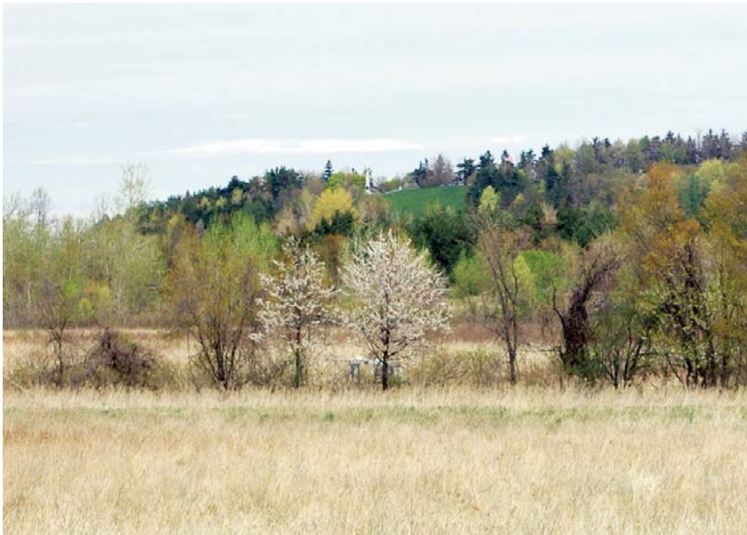
The Hill Cumorah.

Former U.S. Presidents Thomas Jefferson and John Adams died.