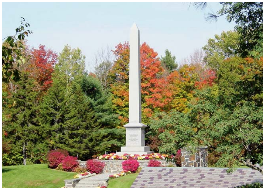
Monument at Joseph Smith’s birthplace in Sharon, Vermont.